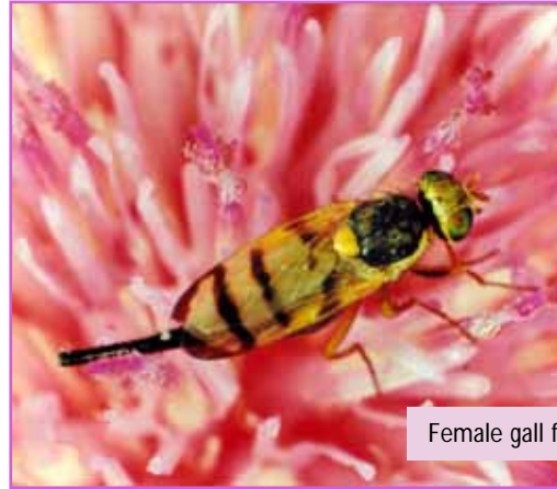
Female gall fly

Look for adult gall flies during summer and autumn. The adults have black bodies, distinctive black stripes on the wings, and are about 5–8 mm long. You may see them flying about or sitting on thistle flower heads. You will not be able to see the eggs as the females use their long black ovipositors to lay eggs inside the green flower buds. Nodding thistle