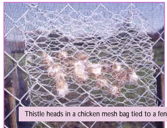
Thistle heads in a chicken mesh bag tied to a fence

Look for infested flower heads once they have dried off in the autumn. You will need to release 50–100 flower heads at each new site and you should leave at least 100 flower heads at your collection site. Use secateurs, or simply thick gloves, to cut or pull the infested flower heads off the plants. We recommend that you put the flower heads in an onion bag or similar (strong enough to last the winter, that has holes in it large enough to let the flies get out in the spring, but is not so large that the flower heads fall out.