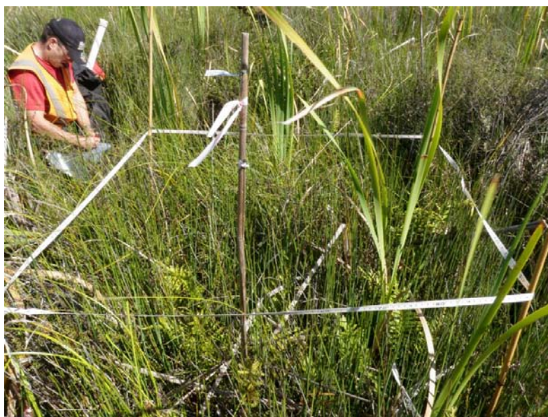
Scott helping with fertiliser experiment harvest, Toreparu

Chris Tanner, Kerry Bodmin, Scott Bartlam, Bev Clarkson and James Sukias harvested our fertiliser experiment after 3.5 years. The experiment was set up to determine whether wetlands along a successional gradient are N- or P- or co-limited as Northern Hemisphere studies have shown early successional wetlands are N- limited and late successional wetlands are P-limited. The experiment will also test the efficacy of the N:P ratio as an indicator of N- or P- or co-limitation This is based on NH studies in wetlands which have shown N:P < 13 indicates N-limitation, N:P > 16 indicates P-limitation, and N:P 13-16 indicates co-limitation or no limitation. We have three study sites: Toreparu Swamp (near Raglan) - early succession; Whangamarino fen (near Meremere) - mid succession; Kopuatai Bog (Hauraki Plains) - late succession. The samples are currently being analysed.