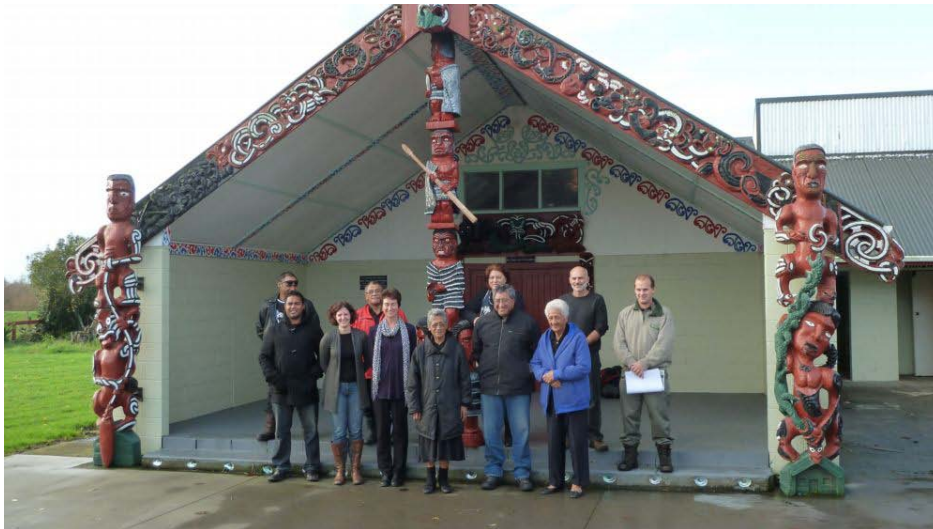
Some of the attendees of the waananga at Maurea Marae.