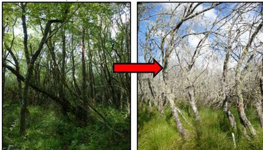
Whangamarino wetland before willow control (left) and 1 year after willow control (right).

Grey willow ( Salix cinerea ) is a troublesome invasive species in many New Zealand mires, as it spreads rapidly and displaces native species. Between January 2011 and March 2014, we investigated the effect of grey willow control on the plant and invertebrate communities in a large-scale BACI-design experiment at Whangamarino wetland, Waikato. In February 2012, half the experimental plots were aerially sprayed with glyphosate, targeted at killing the grey willow present. The recovery of invertebrate and vegetation assemblages has been monitored since then. Initial vegetation results in the treated area showed die back of grey willow canopy with a resultant increase in annuals, perennials (often weedy), and native sedges. The invertebrate community compositional changes were shown to be strongly linked to the plant communities. This suggests that while restoration via invasive plant control can promote the re-establishment of invertebrate communities typical of native wetlands, their long-term sustainability is contingent on prevention of grey willow re-invasions and re-establishment of the native plant habitat. The next phase of the experiment focuses on restoration of a more sustainable native-dominated ecosystem (see next section).