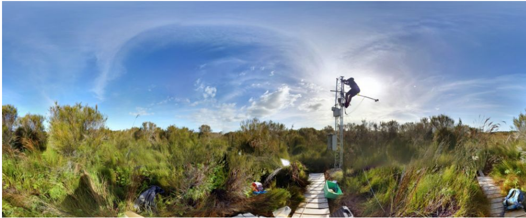
360 degree panorama during research equipment installation at Moanatuatua bog.

questions to be addressed by new PhD student, Joss Ratcliffe (starting October 2015), will be focussed on the impact of the lowered water table on the peatland's carbon balance over annual to decadal timescales, and whether peat is still accumulating. Restoration options will then be explored, hopefully in parallel with improved marginal farmland management.