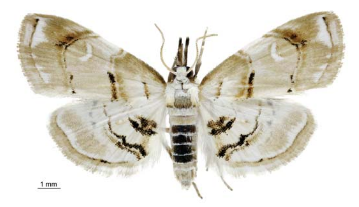
Trichophysetis cretacea , which was reared from privet berries and may have a narrow host range.

"Native puriri moth caterpillars (Aenetus virescens) are also quite common on privet, producing characteristic tunnels and feeding scars in the trunks," explained Chris Winks, who did much of the actual survey work. Passionvine hopper (Scolypopa australis) and the green plant hopper (Siphanta acuta) were common at many sites but the damage caused by sap-feeders like these, either directly by removal of nutrients or indirectly by puncturing the plant and possibly allowing the entry of pathogens, is very difficult to quantify. The combined effect of generalist predators such as spiders, earwigs, ants, and praying mantids could inhibit the effectiveness of some potential invertebrate biocontrol agents for privet, and parasitoids identified during this survey could affect some potential lepidopteran biocontrol agents. These factors will need to be considered down the track when shortlists of potential biocontrol agents are being prepared.