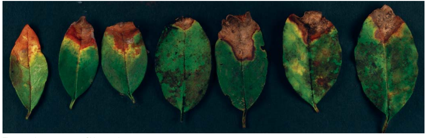
Tip necrosis symptoms on Chinese privet.

reared from privet berries. Adults of this moth were first found in New Zealand in 1999 but its host plants were unknown until now. The larvae of this moth feed inside the berries and leave a neat round exit hole when they leave to pupate. The moth was not present at all sites, but where it was present it was sometimes causing a moderate amount of damage to berries. T. cretacea is native to China and Japan where it is known to be a pest of jasmine ( Jasminium polyanthum ), which is in the same family (Oleaceae) as privet. Further research is needed to determine whether they offer any potential for biocontrol purposes in New Zealand, especially given jasmine is both a very popular ornamental species and an up and coming weed in warmer parts of the country.