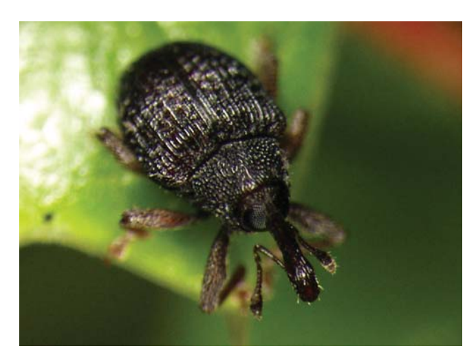
The Darwin's barberry seed-feeding weevil.

Note that we have created a new section on our website relating to agent approvals (see http://www.landcareresearch. co.nz/science/plants-animals-fungi/plants/weeds/biocontrol/ approvals). The aim of this section is to make key information more readily accessible to those with an interest in new-agent applications. Background to, and the rationale for, current applications is provided, along with key references and reports, details about consultation, and answers to frequently asked questions. We hope you find this useful!