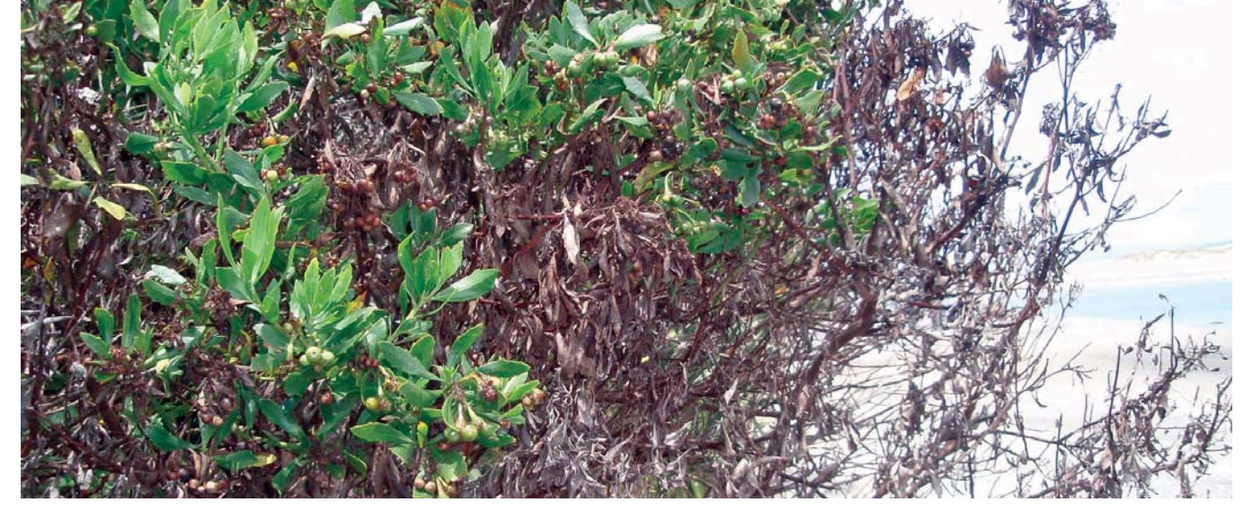
Damage caused to boneseed at Mangawhai by Stemphylium lycopersici.