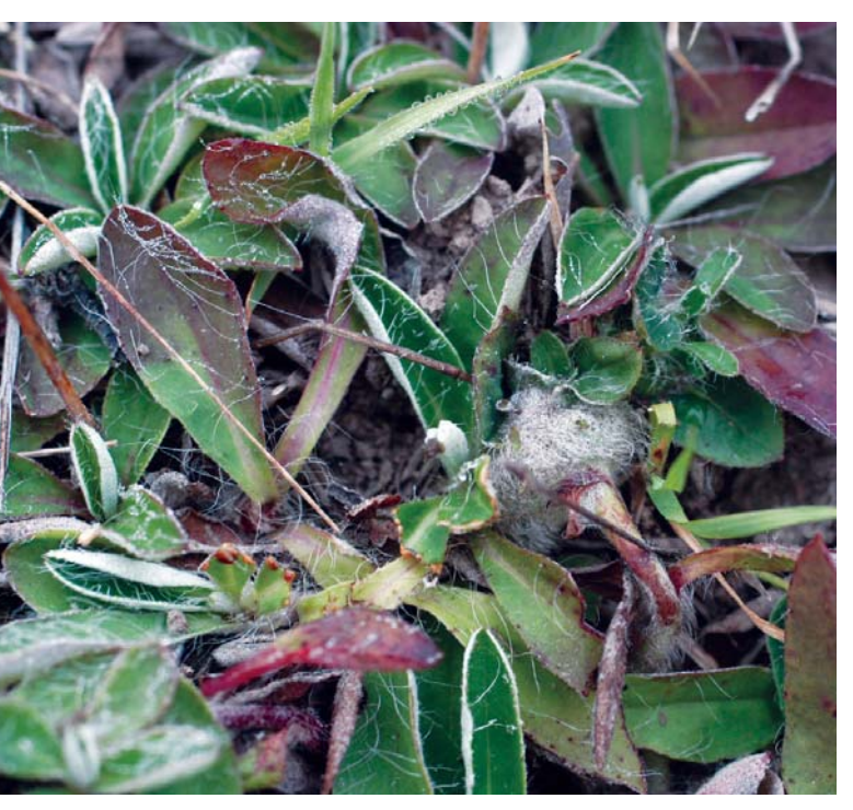
Stolon galled by hieracium gall wasp.

• Early autumn is a good time to check hieracium gall midge and gall wasp sites. Check for hieracium plants that have galls on the ends of the stolons and/or swollen and deformed leaves. If you find good numbers, you could harvest mature gall wasp galls from the end of stolons for release at new sites. Hieracium gall midge is best redistributed by transplanting whole infested plants in the spring.