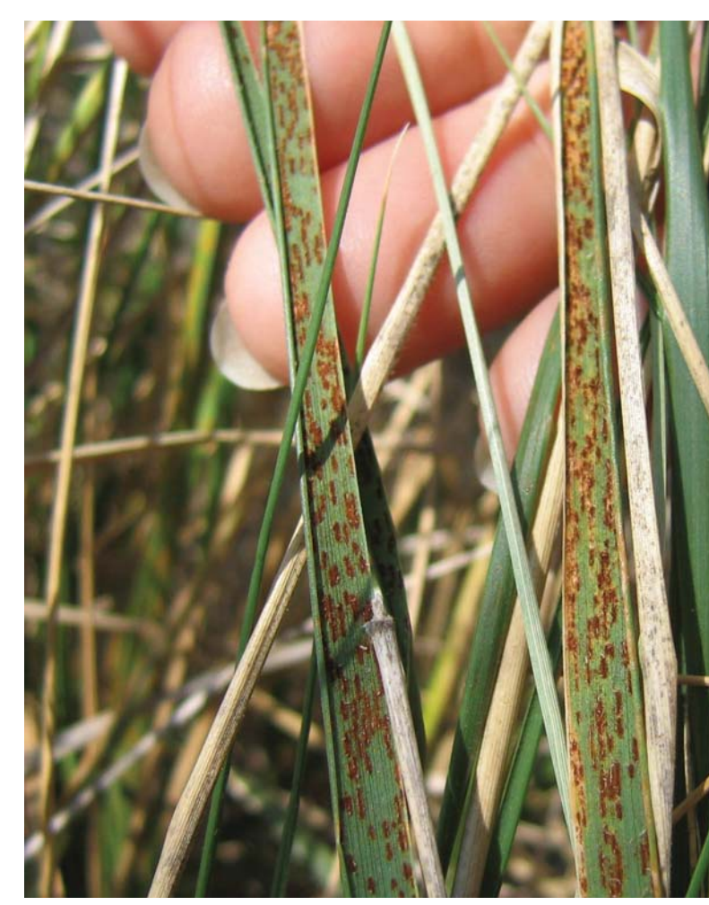
Chilean needle grass infected with Uromyces pencanus.

Freda Anderson (CERZOS-UNS) found the rust and has undertaken all the host-testing in Argentina. When a potential agent cannot even attack all populations of its host plant then the chances of it being able to attack other species are extremely unlikely. Sure enough, not a single spore has formed on the 43 non-target grasses (including oats, barley, rye grass, wheat, rice, bamboo and sweet corn) that Freda has inoculated. Even the closely related weed nassella tussock ( Nassella trichotoma ) is not attacked. So we can be confident that the rust is safe to release in New Zealand, and plans are afoot to prepare and submit an ERMA application