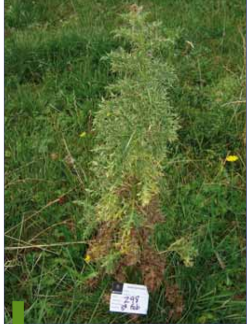
A thistle that yielded the fungus believed to be responsible for the thistle's demise when mown in the rain.

Contact: Graeme Bourdôt (graeme. bourdot@agresearch.co.nz).