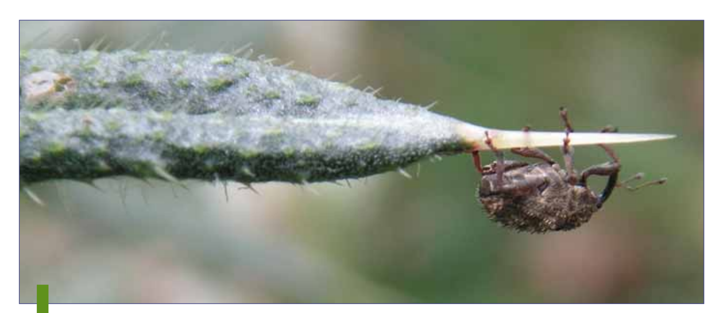
Nodding thistle crown weevil adult negotiating a Scotch thistle.

This project was funded by the Foundation for Research, Science and Technology under the Outsmarting Weeds Project.