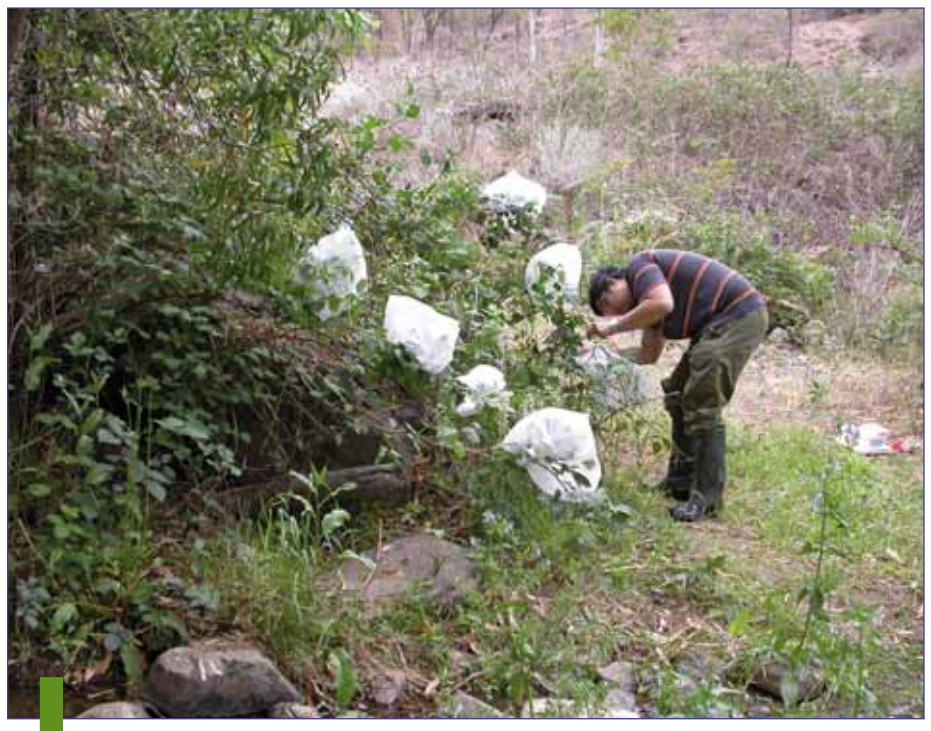
Don Gomez (CSIRO) releasing new blackberry rust strains in Tumut in November 2006.

There is just one possible downside to this gift horse. Several New Zealand native Rubus species were tested against a pool of 15 isolates of the rust before the first official strain was introduced to Australia, and were found to be possibly at risk of attack. Such testing done under optimal conditions often overestimates what really happens in the field, and subsequent non-target surveys here only found one instance of very minor attack on bush lawyer ( Rubus cissoides ) (see No surprise that Aussie Rust Misbehaves , Issue 32). "It is possible that the increased genetic diversity provided