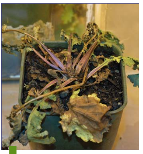
Ragwort plant showing damage caused by the ragwort plume moth.

Check release sites. Look for plants that have wilted or blackened or blemished shoots. Damaged shoots will also have holes in the stems and an accumulation of debris on silken webbing. You will need to pull some damaged plants apart to see the caterpillars, which are initially pale and later become green and hairy. Please let us know if you find any.