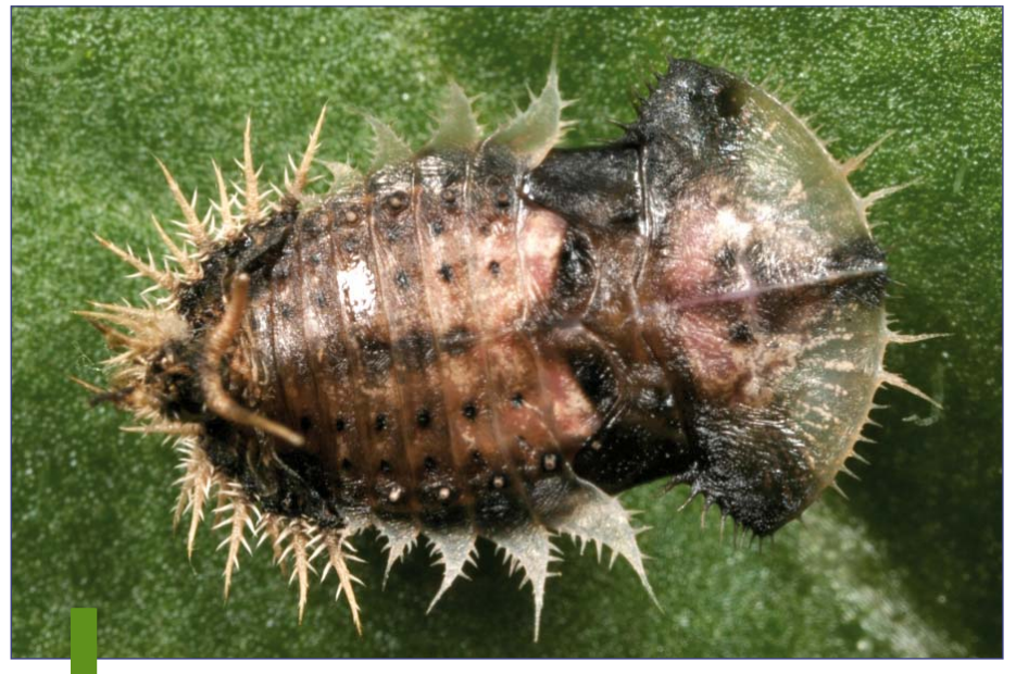
Green thistle beetle larva.

unfortunately too many per plant, so the plants were sickening before the larvae could move onto healthy ones," said Hugh Gourlay. The weevil adults need a winter conditioning period before we can take them out of quarantine. However we