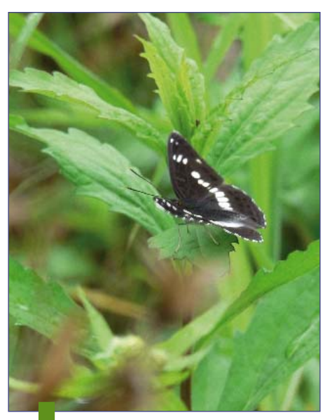
The white admiral, while attractive, is unlikely to be sufficiently specific.

We did not pick up many pathogens during the survey and think that it may be due partly to the time of year (spring). "We did notice a downy mildew on several plants, a couple of leaf-spots, and