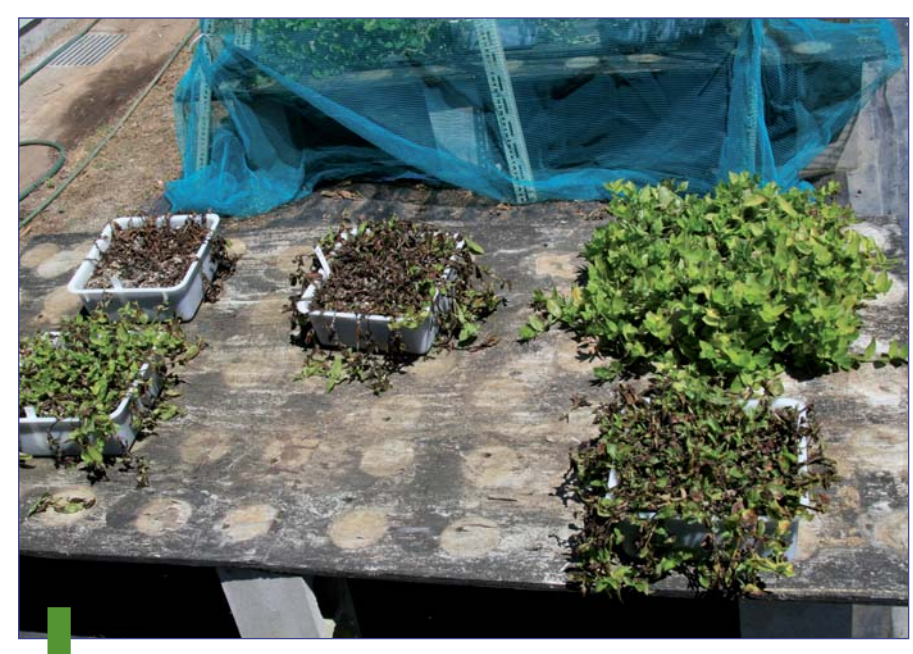
Tradescantia plants showing different levels of defoliation.

This project is funded by the Foundation for Research, Science and Technology as part of the "Beating Weeds Programme".