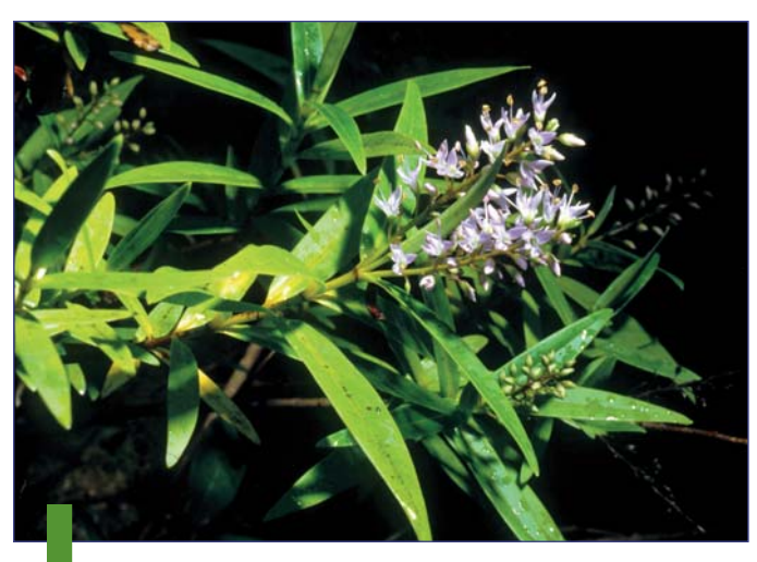
The biocontrol of mist flower has reduced the pressure on threatened Hebe acutiflora .