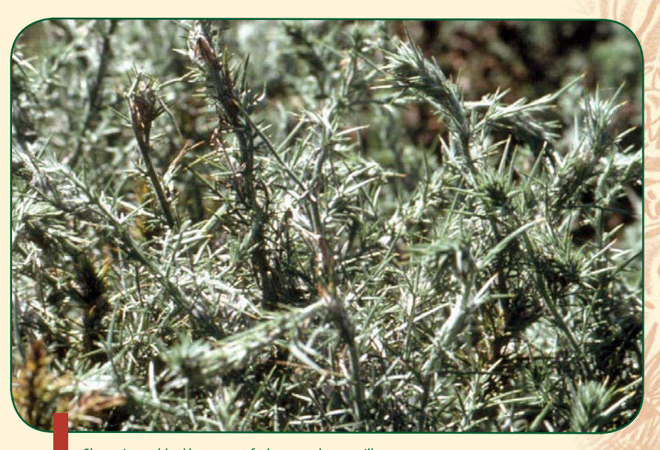
Shoot tips webbed by gorse soft shoot moth caterpillars.

Check release sites. Aim to visit sites in late November/early December when the caterpillars are about halfgrown. Look for webbed or deformed growing tips with dark brown or