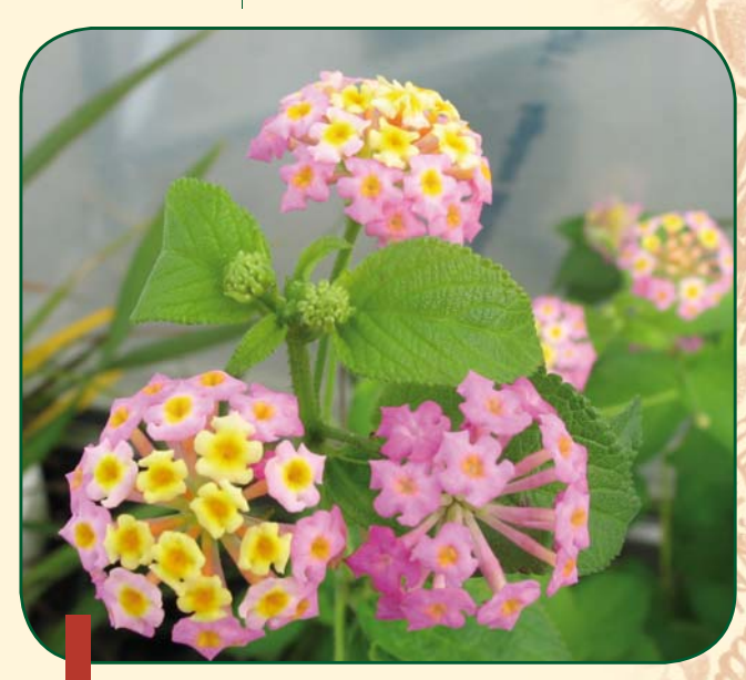
The yellowish-pink flowering form of lantana that is common in New Zealand.

less common reddish/orange flowering form collected from the Bay of Plenty. This means that the way is now clear to proceed with host-range testing provided sufficient funding can be found. Also while we don't think the rust has yet made it to New Zealand of its own accord, we need to double-check before proceeding too much further.