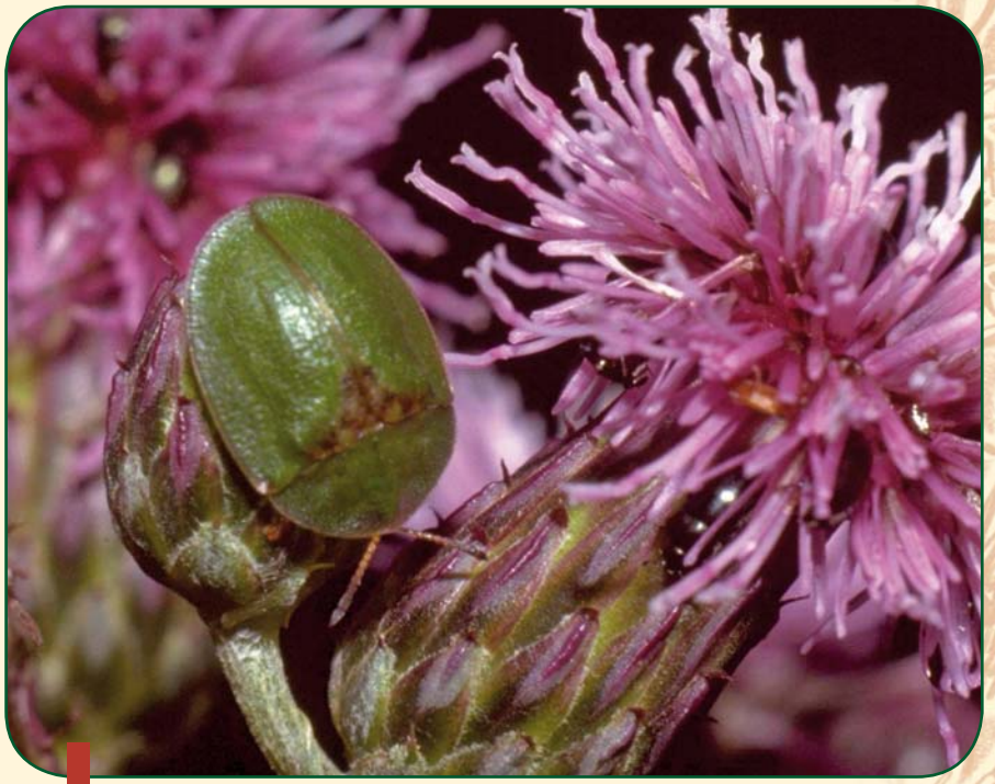
The green thistle beetle.

The first multi-tasker is a tiny black weevil that bores into thistle stems (Apion onopordi). This weevil is an exciting propect because, in addition to the damage it causes by feeding on thistle stems and roots, it also vectors the Californian thistle rust (Puccinia punctiformis). This rust is present in New Zealand but is limited in its ability to disperse and infect Californian thistles. The rust benefits from improved dispersal by the weevil, which in turn does better on rust-infected thistle stems than uninfected ones. Host range tests showed the weevil is specific to plants within the Cardueae. It prefers Scotch thistle and Californian thistle (if rust-infected)