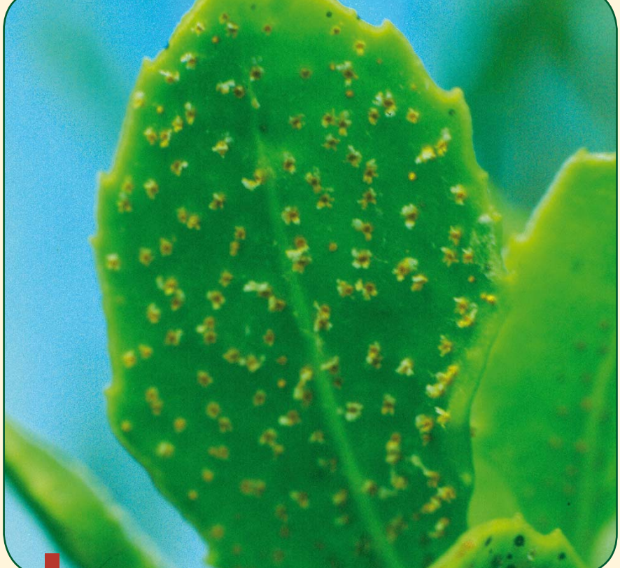
Boneseed leaf covered with rust pustules.

This project is funded by the national collective of regional councils and the Department of Conservation.