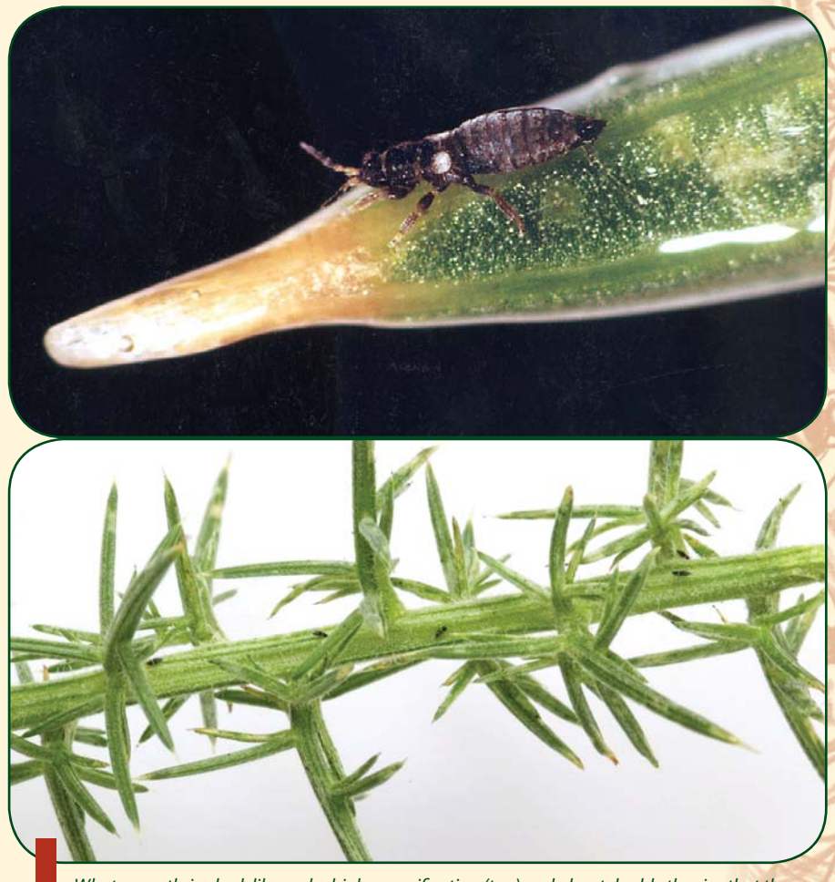
What gorse thrips look like under high magnification (top) and about double the size that they are in real life (below).

Don't forget to take your field guide along with you, and let us know how you get on!