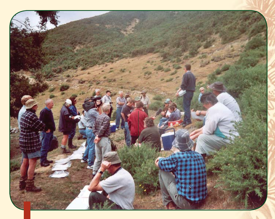
Gorse soft shoot moth field day at Blenheim.

found to be well established there too. Regional council staff from as far afield as Auckland and Southland attended in the hopes of establishing the moths more widely. A good contingent from Horizons Regional Council and Tasman District Council joined in too. The moth is now widespread in Marlborough with some people discovering the moths were already present when they went to release them. The moth is also continuing to do well in Canterbury, but continues to be elusive in the North Island.