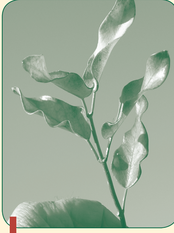
Diseased moth plant from Awhitu Regional Park

"The plant was exhibiting symptoms that are often commonly associated with a