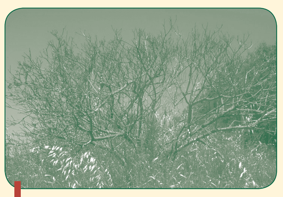
What the boneseed leaf roller can do to boneseed in its homeland.

However, no-choice tests can often lead to "false positives" when insects are forced to accept a plant species they would never utilise in nature. Specialist insect herbivores commonly show a broader host-range in no-choice tests than in choice tests, where the normal host plant is presented along with the test plant. Usually this increase in host-range is small, for example, in a no-choice situation the lantana