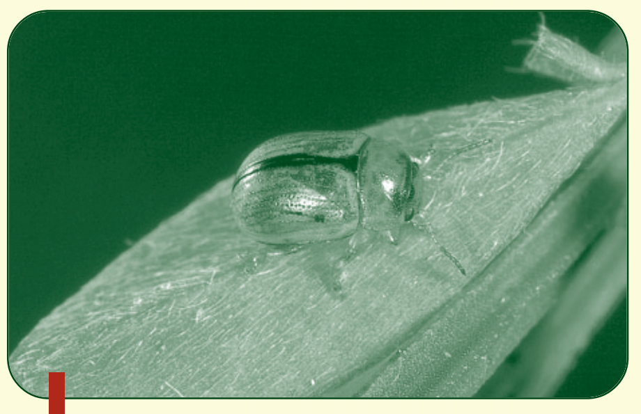
Broom leaf beetle

As far as new broom agents go we are also interested in a stem-tying moth ( Agonopterix assimilella ) that is found throughout Western Europe. The larvae