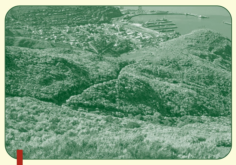
A snapshot of the problem: broom-covered hillsides on the Port Hills above Lyttelton

The first step was to identify the groups likely to be positively or adversely affected. Land managers, including regional councils and the Department of Conservation, and the farming and forestry industries would all benefit