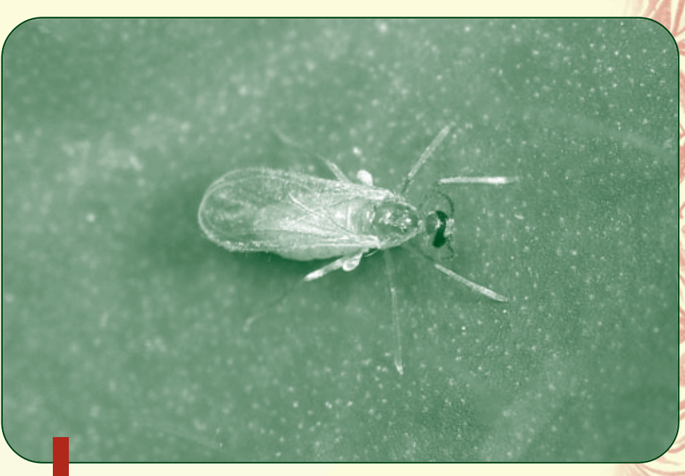
Hieracium gall midge adult

Two down now three to go. "We just need to mass-rear, release, and establish the