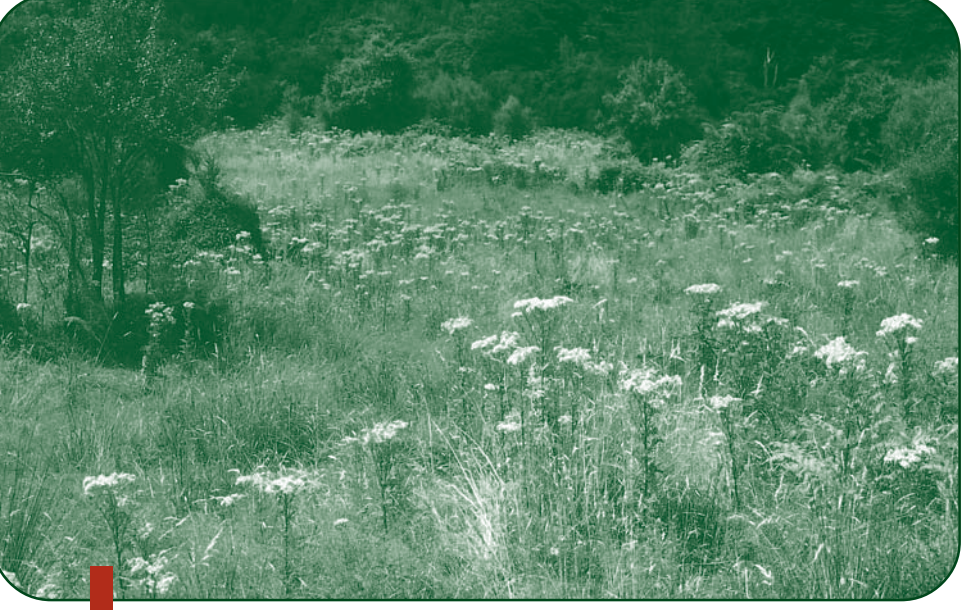
Ragwort is unfortunately still a familiar sight in many places on the West Coast.

We still have good stocks of most of the information sheets that comprise "The Biological Control of Weeds Book". If you would like a supply of any of these sheets for giving out at displays, field days, or to students doing essays etc. then please contact Lynley Hayes (hayesl@landcareresearch.co.nz, or Ph 03 3256 701 ext 3808).