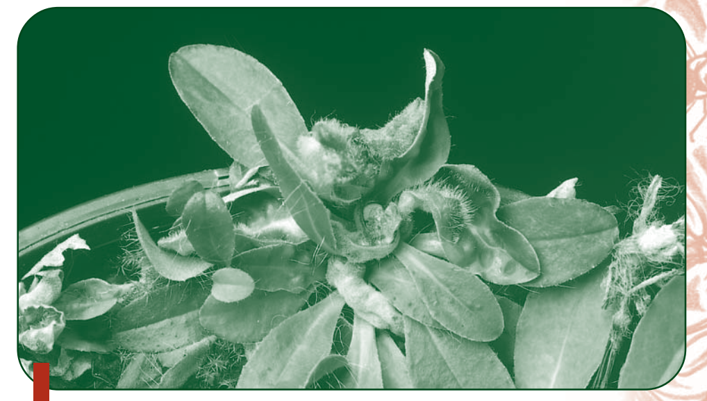
Typical gall midge damage.

The midges have been released at 12 sites this season (see table over page) and most of these were made possible by funding from the Hieracium Control Trust. Because the adults are fragile and short-lived (2–13 days) the best way of releasing them seems to involve planting out infested plants. We will continue to mass-rear the midges for at least another couple of years (enquiries to Lynley Hayes, hayesl@landcareresearch.co.nz or Ph (03) 325-6701 ext 3808).