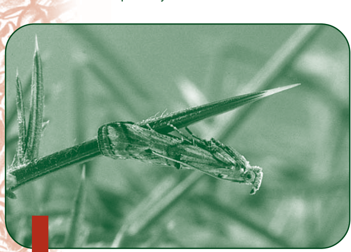
Gorse colonial hard shoot moth

We are organising a weed ecology workshop for the 2nd of April at Lincoln. This is an opportunity for our weed ecologists to share with you some of the insights they have learnt through their research. Some of the topics that we expect to cover include: are invasions all bad news. gorse and broom dispersal, how to prevent wilding conifer spread and control existing infestations, plus woody weeds and native shrubland restoration in Central Otago. This weed ecology workshop is free of charge and open to all interested people. To secure a place at this workshop please contact Lynley Hayes (Ph 03 3256 701 ext 3808, hayesl@landcareresearch.co.nz).