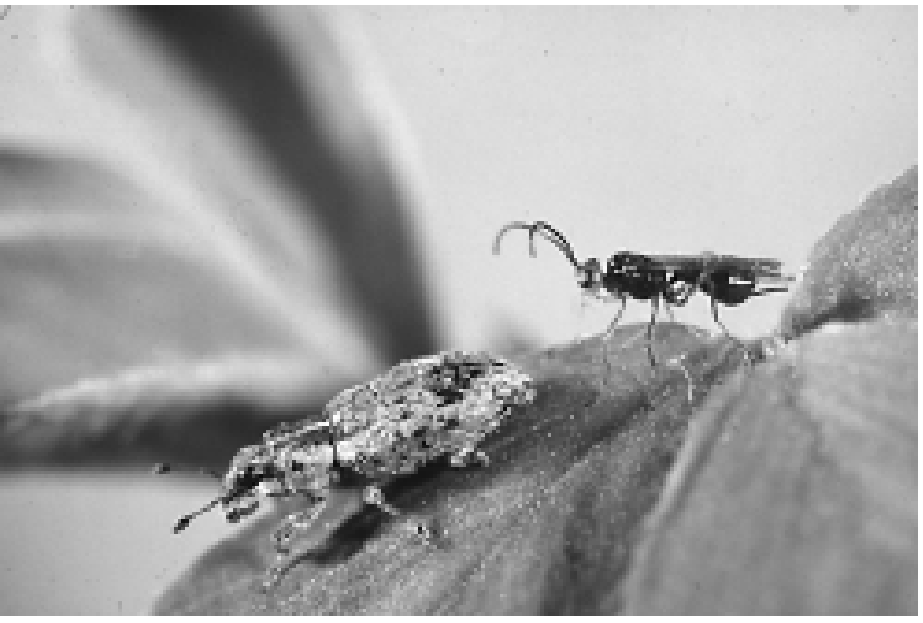
M. aethiopoides approaching Sitona

The parasitoid lays eggs in the adult stage of its host, which normally makes the females sterile. Whether M. aethiopoides is likely to reduce the potency of the nodding thistle receptacle weevil depends on a number of factors, such as how often the two actually come into contact and the resulting level of attack. AgResearch's Biocontrol and Biosecurity Group has carried out laboratory and field investigations to see just how good the parasitoid is at nobbling the receptacle