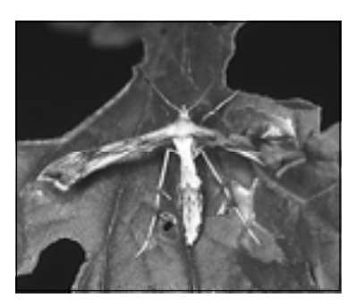
Ragwort plume moth

hind wings divided into three feathery plumes. The larvae initially burrow into the leaf petioles and then tunnel down into the crown and roots where they continue to feed and grow. The damage caused by older larvae is usually fatal to ragwort plants