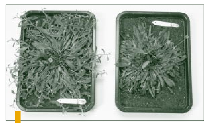
Left: Mouse-ear hawkweed producing healthy stolons. Right: Stolon growth is severly retarded after attack by the hieracium wasp

poorly, and the Californian thistle flea beetle (Altica carduorum) does not appear to have established at all. The Californian thistle gall fly (Urophora cardui) has had a significant impact on the plant overseas, but hasn't really had much of a chance to get going here. The Californian Thistle Action Group have set about remedying this by rearing the flies in special cages outdoors. This rearing was successful, and we hope that it can continue for a number of years until the distinctive galls become a regular feature on Californian thistles nationwide. By that time, hopefully, we will have some new agents to work alongside them. The group is also contributing to surveys in eastern Europe and western Asia to look for new agents, particularly stem- and rootboring insects that may damage the plant sufficiently on their own or work well with pathogens. A pathogen with the ability to severely damage Californian thistle has recently