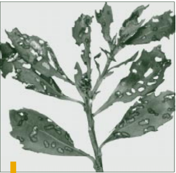
Bone-seed damaged by the garden

In New Zealand nassella tussock (and its close relative Chilean needle grass) seem to be disgustingly healthy. "Although I managed to isolate a huge number of pathogens from these plants, they were mostly just the sorts of secondary infections that you often isolate and there was nothing to write home about,"