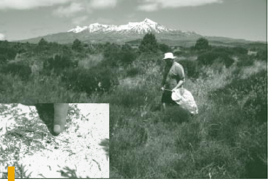
The glorious moment — Simon Fowler tracks down heather beetles at last!