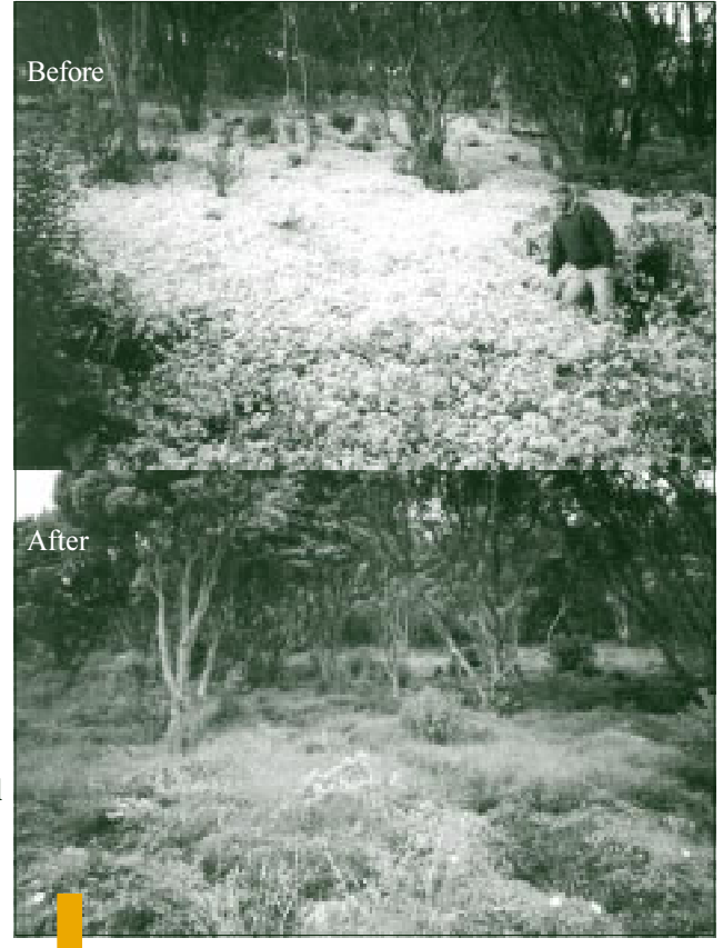
Chris Winks knee deep in mist flower at Mt Eden before the release of the white smut and the same site just over a year later. The white smut has already knocked the mist flower hard

flower had increased by a whopping 7000 m<sup>2</sup> in only 1 year and now totals 31 000 m<sup>2</sup>! The results froma nationwide survey asking people wherethey have seen mistflower have also been collated and all known infestations mapped and their environmental characteristics compared.