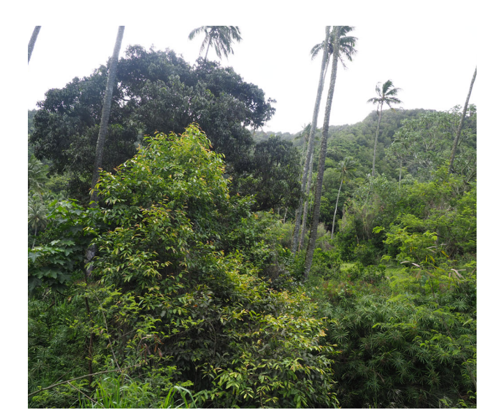
Balloon vine in December 2017 before the rust was released (top), visibly diminished 6 months later (middle), and virtually gone by November 2018 (bottom).