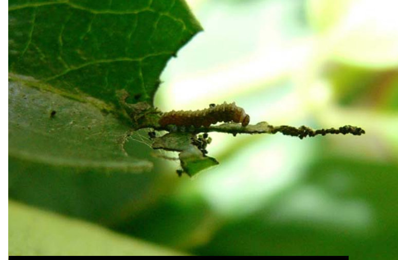
Small Japanese honeysuckle white admiral caterpillar resting on its pontoon.

Although the fungus was only released this past autumn, promising signs of likely establishment seen only a few months afterwards make it worth checking release sites this spring. Look for the distinctive yellow spots on the upper surface of the leaves with corresponding white spots underneath, especially after wet humid weather. Feel free to take a photo to send to us for confirmation if you are unsure, as occasionally other pathogens do damage tradescantia leaves.