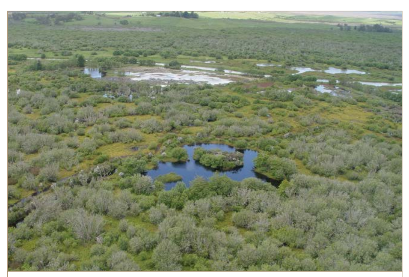
Internationally important Whangamarino Wetland.

A cultural indicator is a tohu (sign, marker) for tangata whenua, and needs to be a meaningful indicator that can be used to understand the overall state of the environment. Cultural indicators should be developed from localised knowledge, in collaboration with whaanau, marae, hapuu, iwi, and kaitiaki (guardians) communities to make them relevant and connected. For a detailed description of cultural indicators please refer to the Cultural Resources section: Indicators for cultural resources.