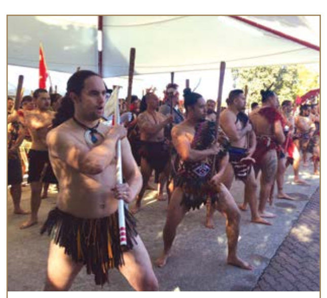
The return of Rangiriri Paa, Koroneihana, Tuurangawaewae Marae 2016.