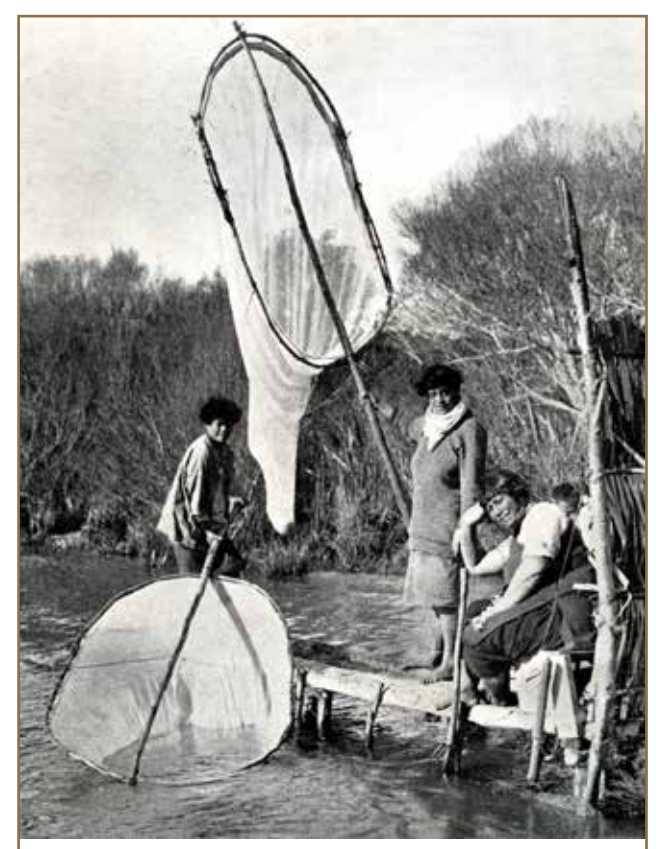
Women fish for matamata on the Waikato River near Tuakau.

In comparison, catches in the kaka (scoop net) rely on the strength of the fisher and the carrying capacity of the kaka. Because the volume of the net is generally smaller than the set net, it takes more effort to pull in the same amount of fish. This is a key reason why the set net has gained in popularity, particularly on big rivers like the Waikato.