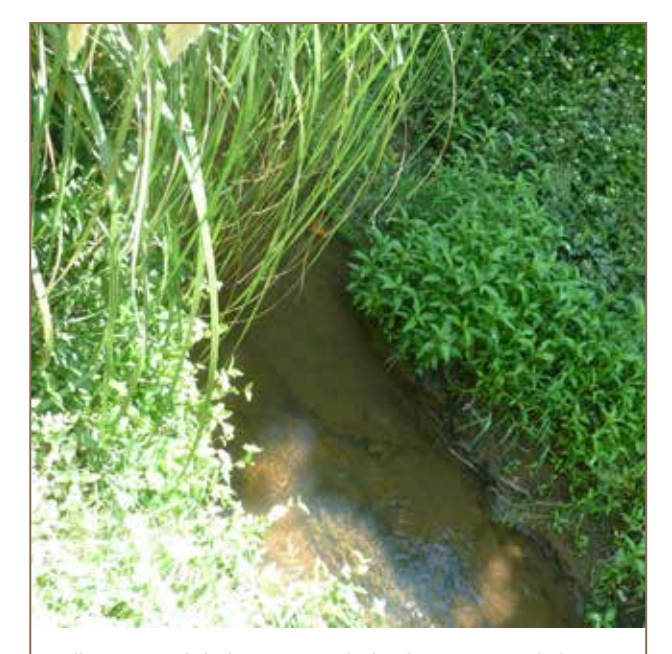
Alligator weed choking potential whitebait spawning habitat.