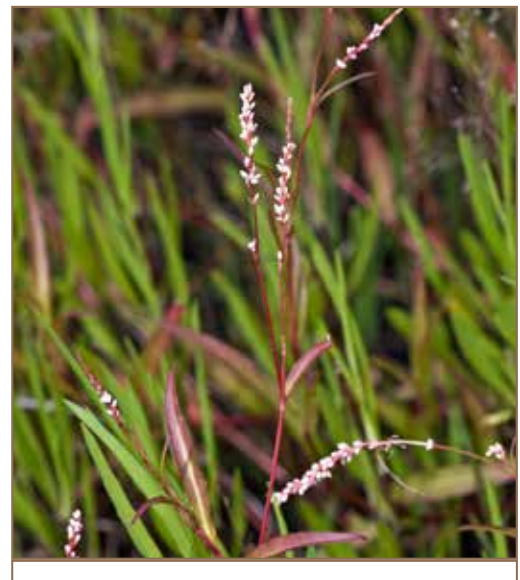
Tūtunāwai, swamp willow weed.

* Refers to names that are also common to other iwi