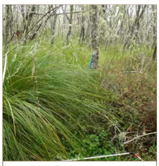
Pūrekireki (also known as pūrei), swamp sedge.