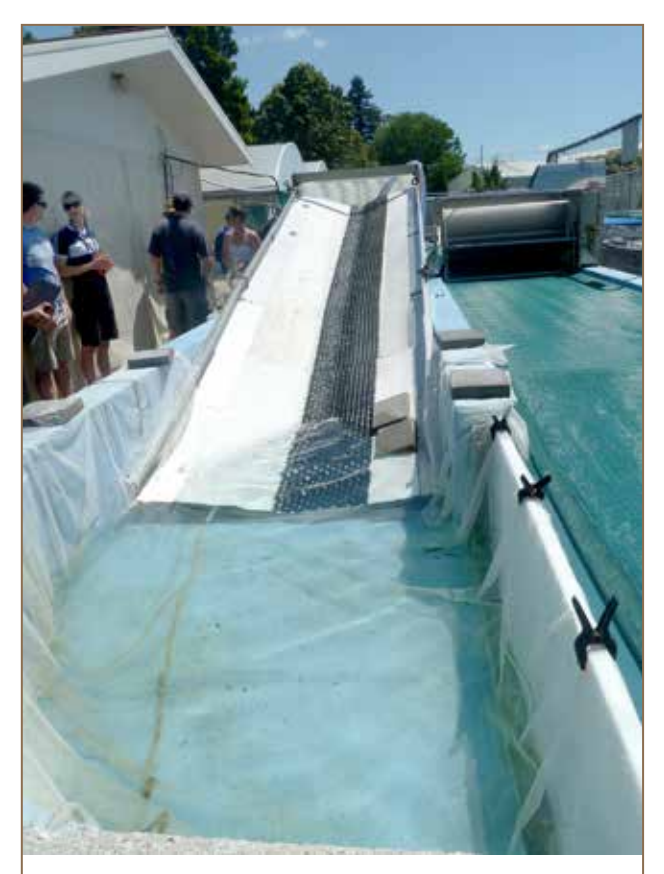
Understanding barriers to fish passage (NIWA experiment). Photo: Joanna Katipa

Waikato River whānau learning about impacts of urban design for native fish habitat. Photo: Joanna Katipa