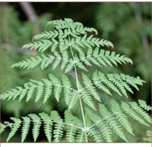
Mouka (also known as mātātā), water fern.