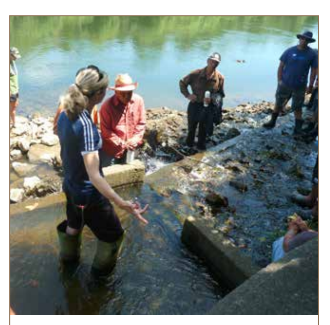
Waikato River whānau learning about fish pass design for whitebait access.