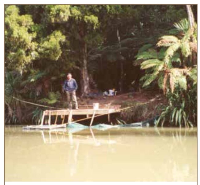
Fisher from Mokau with set net.