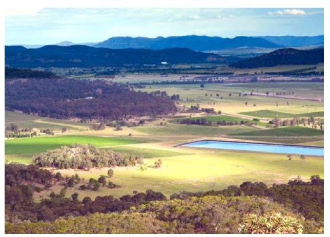
Figure 4: Hunter River Basin, New South Wales, Australia