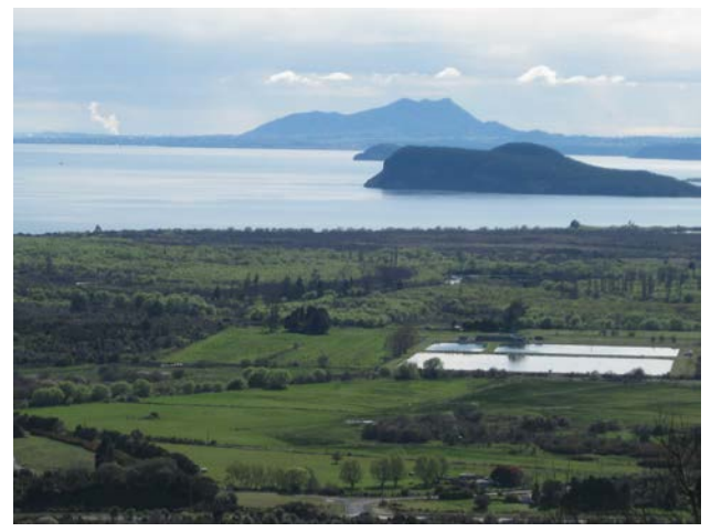
Figure 5: Lake Taupo, New Zealand