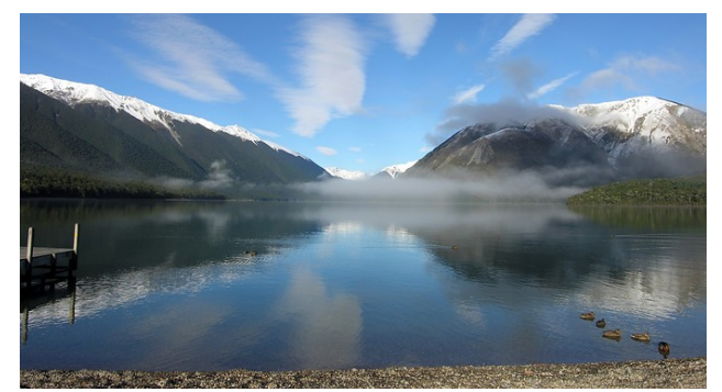
Figure 8: Nelson Lakes National Park, one of New Zealand's protected areas