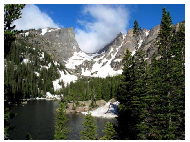
Figure 6: Rocky Mountains, Colorado, USA

Colorado Big-Thompson (CBT) Trading Scheme (USA): A well-established water rights trading system that diverts water from the western slope of the Rocky Mountains to the eastern slope. The rights to the water from the CBT project have been allocated to users (farmers, industries, municipalities). The water rights are homogeneous and well understood. The water rights market, in existence since the 1960s, includes market prices, brokers, short-term rentals, and permanent leases of water in the system. Trades occur within the agricultural sector and between the agricultural and municipal and industrial sectors. The unit of trade is one acre foot (1200 \text{ m}^3) for one year, and a total of 310 000 acre feet (380 000 000 m3) per year of water are allocated by the CBT project. In years with above-average rainfall the allotment is cut back proportionally to save for dry years. Similarly, allocations are proportionally reduced if there are less than 310 000 acre feet (380 000 000 \text{ m}^3 ) available for a given year. The trading system is run by the Northern Colorado Water Conservation District (Carey & Sunding 2001).