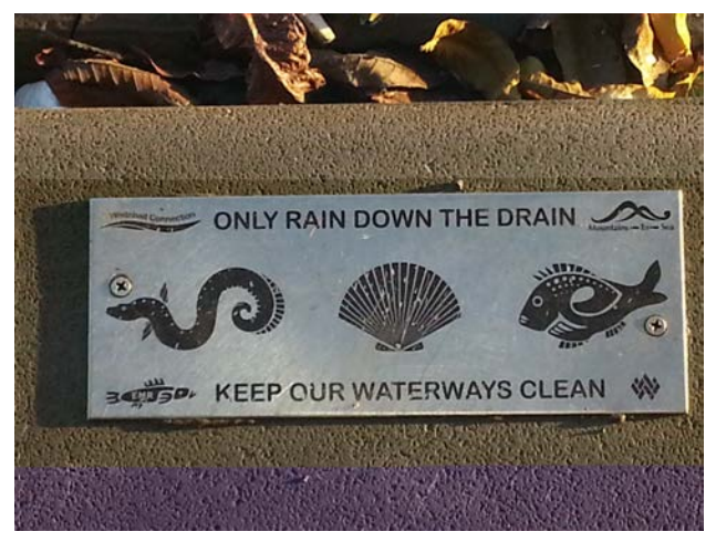
Figure 2: The Drains to Harbour programme symbol on roadways, Whangarei, New Zealand