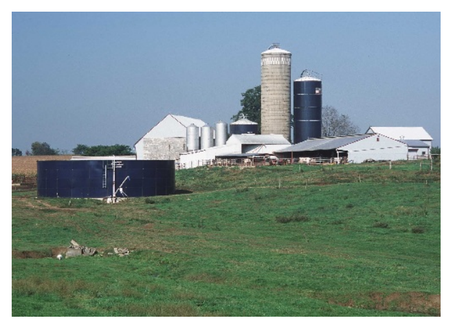
Figure 7: Manure storage, Lancaster, Pennsylvania, USA