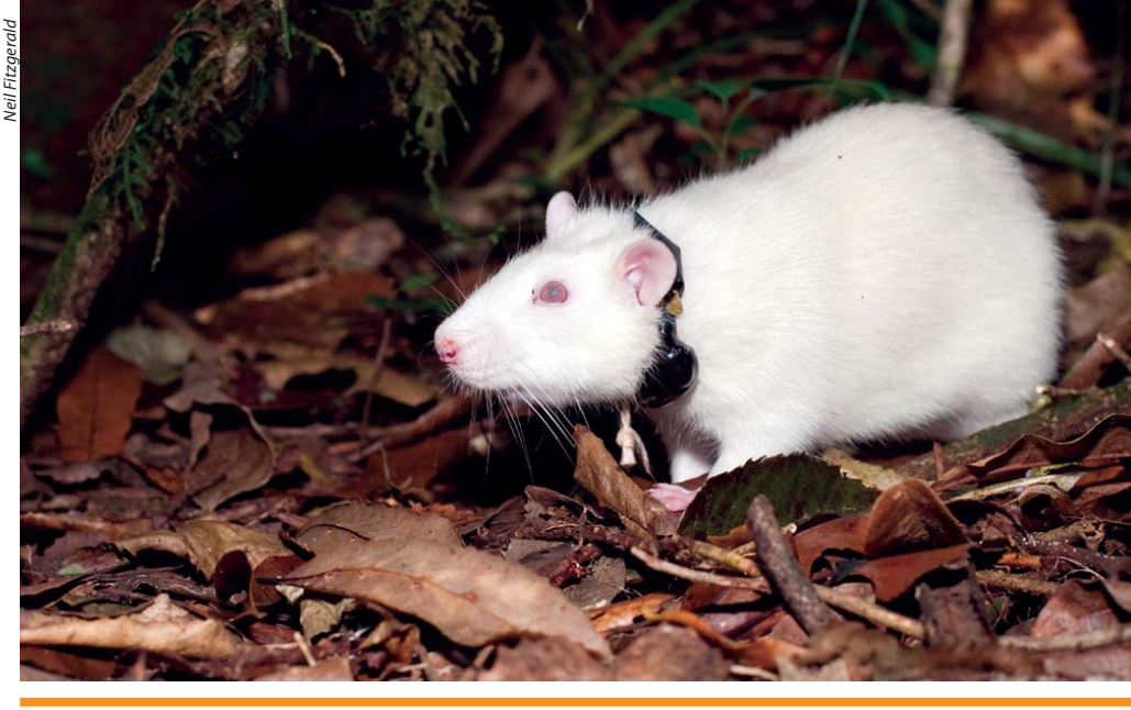
Radio-collared laboratory rat used to lay scent trails to test rodent dogs at Maungatautari, Waikato.

The researchers concluded that well-trained rodent dogs and their handlers are likely to be able to locate wild rodents at low densities in forest situations. Each handler and single dog team should be able to cover 30–40 hectares of typical forest in 0.5–1 day, but this will vary greatly with terrain and vegetation. Of course, another technique is then required to actually catch and remove the offending rodents, but dogs can provide some confidence to managers that rodents are present or not.