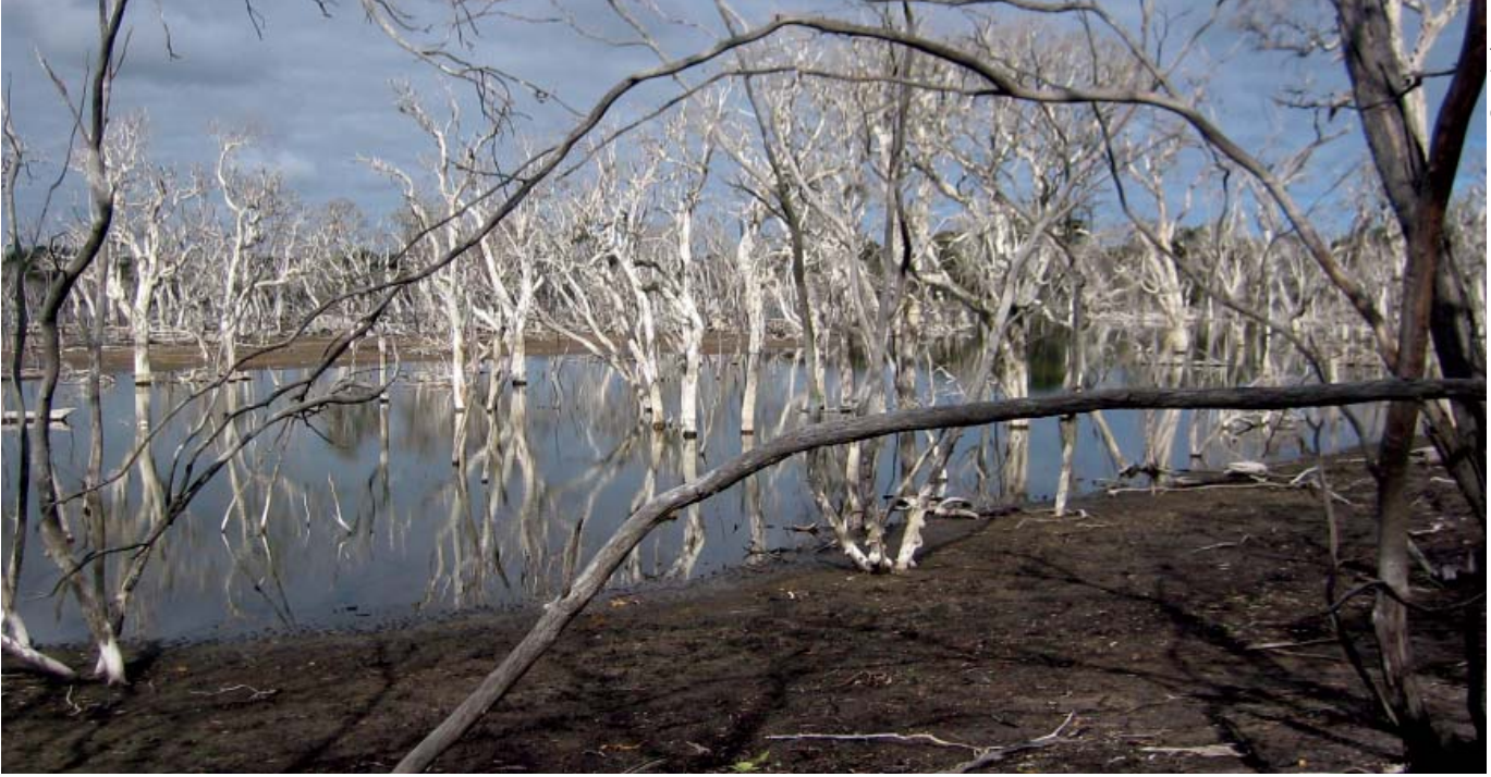
Dead trees in a swamp that provide nesting sites for starlings.