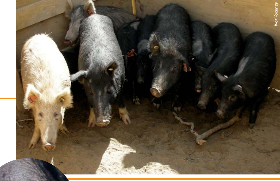
A group of captured wild pigs, some of which have been implanted with GPS data loggers (see photograph of implant site at left).

The home range and movement patterns of wild pigs are notoriously difficult to determine, as pigs either destroy or remove radio-tracking collars and harnesses shortly after these are attached. To overcome this problem, Jagath Ekanayake and his colleagues have developed and trialled an implantable GPS data logger that can record 2–24 GPS locations a day for up to a year. These implants are less likely to get damaged than collars and, in theory, could replace external GPS units. The pilot trial involved surgically implanting prototype GPS units at different depths under the skin of pigs to test for differences in the unit's accuracy with the depth of the implant. The pigs were kept in a 1-ha enclosure so their exact location was always known.