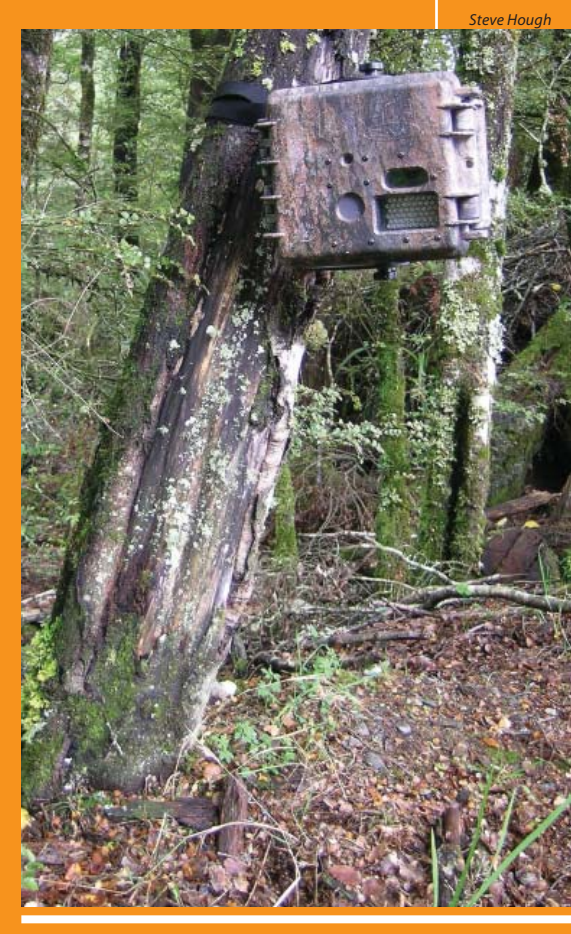
Trail camera set up to monitor possum activity at a bait station.