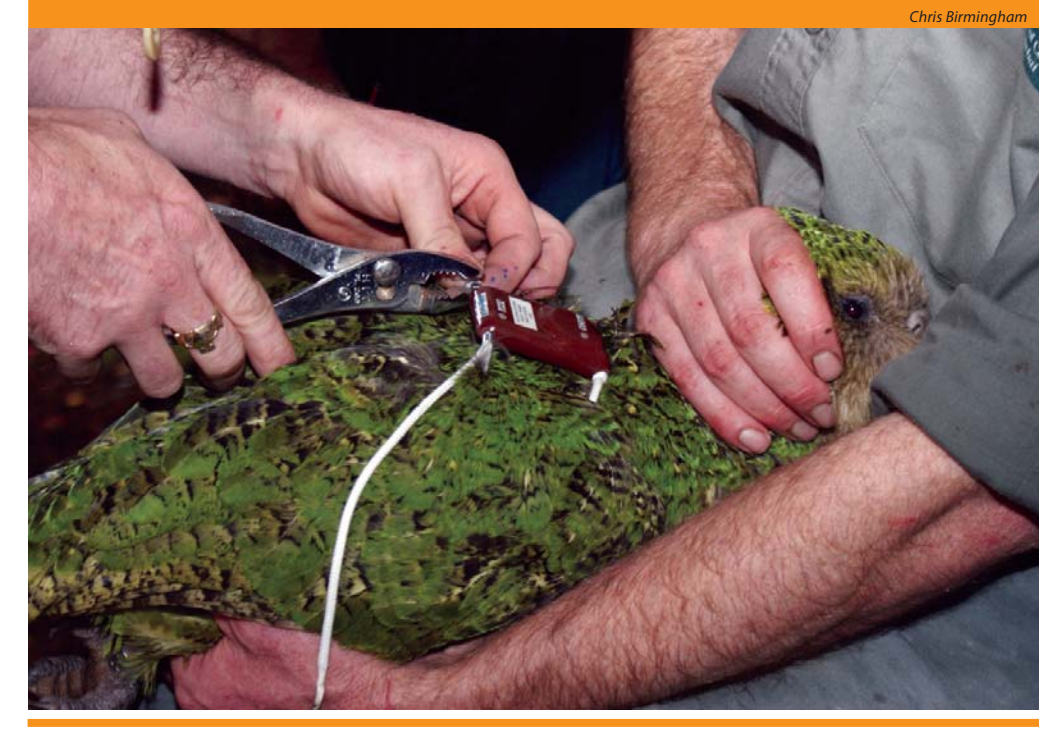
Rangi, one of the kākāpō being monitored, having his micro-proximity transmitter attached.

*Sirtrack is a subsidiary of Landcare Research