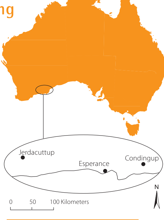
Fig. Area in Western Australia with existing small populations of starlings.

Habitat preferences of starlings vary across the landscape, and this influences the probability that a bird will be present in a particular area. Starlings tend to nest in holes in trees located in swamps, forage in livestock paddocks, and avoid standing crops (swamp photo). Very high frequency (VHF) telemetry data have