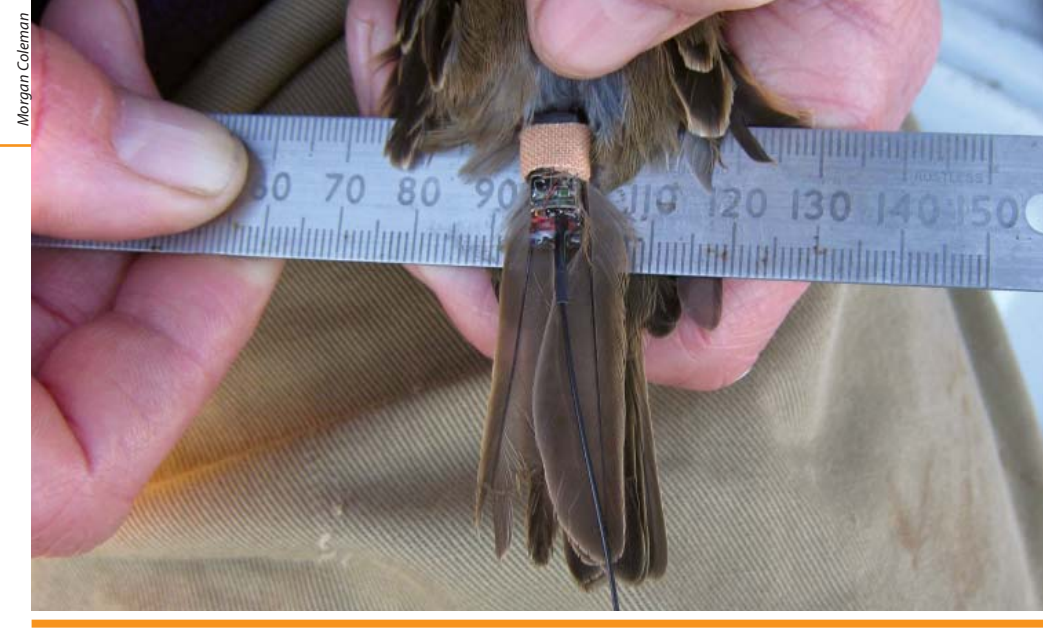
Kev Drew fitting a tailmounted VHF transmitter to a house sparrow.