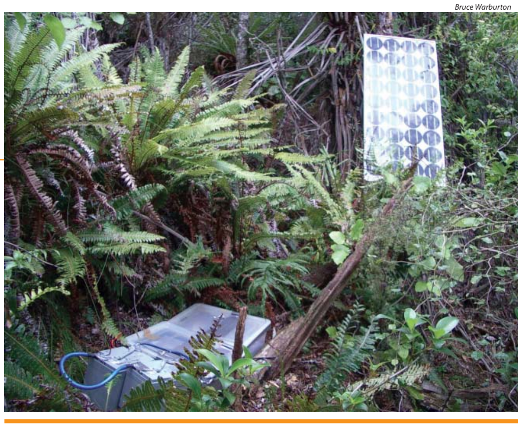
The scanner and data logger in a waterproof box and linked to a solar panel for continuous operation.

This work was funded by the Foundation for Research, Science and Technology.