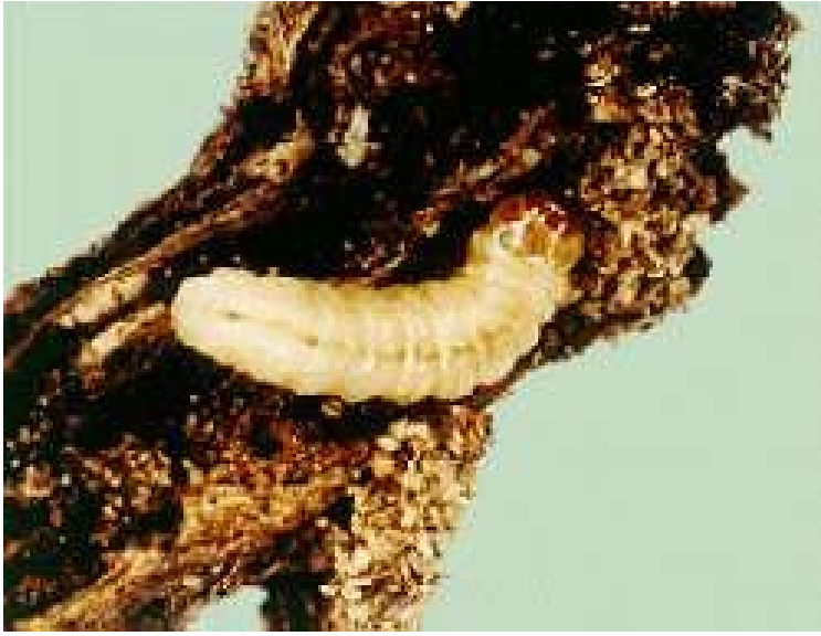
Horehound clearwing moth and larva ( Chamaesphecia mysiniiformis )