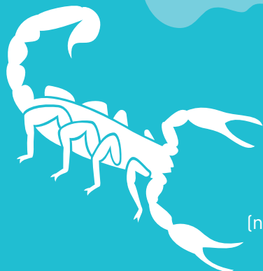
Akarava Scorpion (not found in NZ)