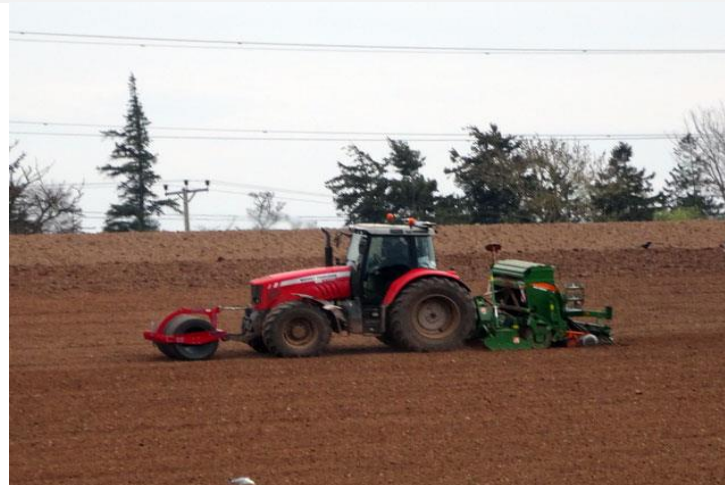
Soil Health and Resilience: oneone ora tangata ora

Presentations, workshop, discussion & feedback