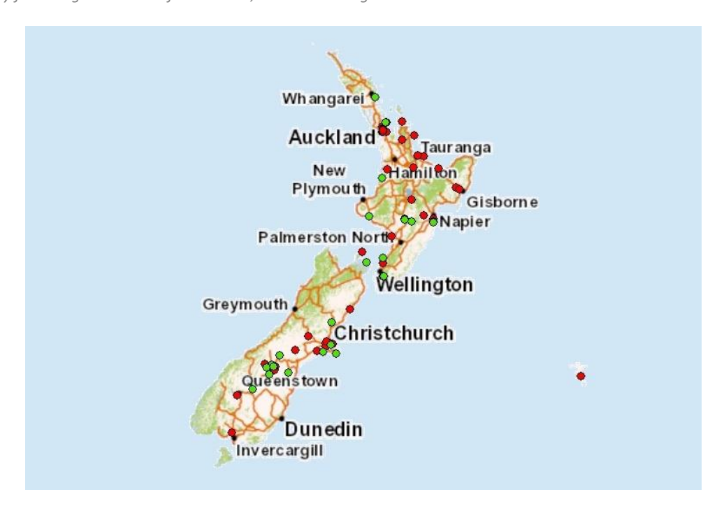
Figure 4: Occurrences of Marrubium vulgare in Department of Conservation database (green dots) and the Australasian Virtual Herbarium (red dots).

The plant grows in alkaline and poor soils. It is an early coloniser of eroded areas, sheep camps, rabbit warrens, and other disturbed sites, from which it encroaches into adjacent farmland (Fig. 5). It is primarily a problem in high country lucerne crops, where chemical control is proving ineffective. Areas treated chemically become bare, resulting in soil erosion (Fig. 6). Marrubium vulgare tends to be the first plant to regenerate following chemical control. The long tap-root makes M. vulgare a strong competitor in dry conditions and the plant takes hold faster in dry years than in wet years. Given long-term predictions that the dry, eastern parts of the country could become even more drought-prone, M. vulgare populations are expected to expand dramatically. The problem is exacerbated by the push to convert an increasing area of dryland pastures into lucerne, which facilitates further M. vulgare invasion.