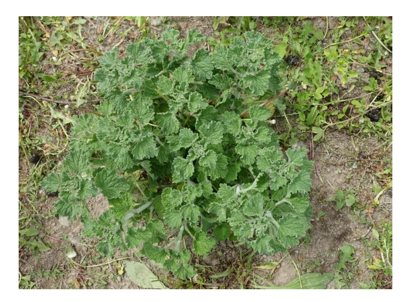
Figure 2: A young M. vulgare plant.

In its southern European native range populations of M. vulgare are scattered and low-density, occurring in warm areas, on wasteland, on well-drained calcareous soils, and on intensely grazed sites (Weiss & Sagliocco 2000; Rodriguez Villanueva & Martin Esteban 2016). In India it grows at an altitude between 5,000 and 8,000 ft (1,500–2,500 m), and can grow up to 120 cm tall (Masoodi et al. 2008). The plant shows plasticity in adaptation to tolerate droughts (Habibi & Ajory 2015).