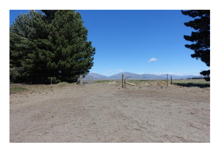
Figure 6: Soil erosion following herbicide treatment of M. vulgare . Mckenzie country.

Marrubium vulgare fruit form burrs with small hooked spines that attach easily to fleece, more than doubling the cost of processing the wool. In the absence of M. vulgare , New Zealand wool is globally renowned for supreme cleanliness and near-freedom from organic matter, but in the presence of M. vulgare this wool downgrades to the lowest grade, has to be manually separated from non-contaminated wool, and is no longer suitable for processing locally, having to be shipped to Australia for processing. Grazing animals contribute to seed dispersal via movement of burrs and seeds attached to their fleece.