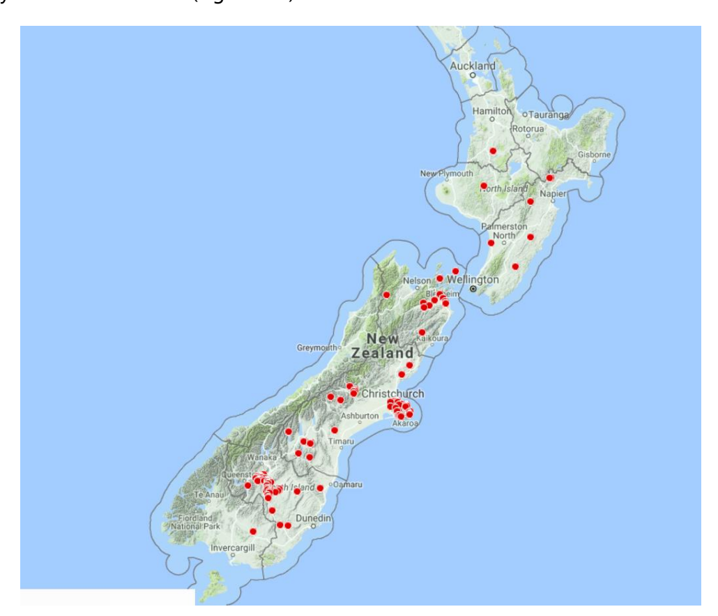
Figure 3: Occurrences of Marrubium vulgare in permanent vegetation plots in the NVS database (https://nvs.landcareresearch.co.nz/Data/Search).

Marrubium vulgare is presumed to have been introduced to New Zealand deliberately, for its medicinal properties, and was first recorded as naturalised here in 1867 (Webb et al. 1988). It was noted as abundant in New Zealand by 1906 (Cheeseman 1906). The plant is now found in all of the low-rainfall parts of New Zealand, and forms especially dense stands in the high country of the South Island (Figs 3 & 4).