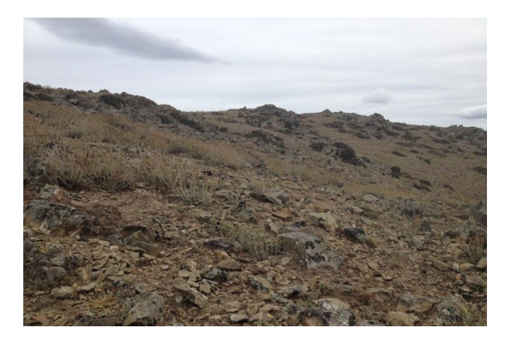
Figure 5: High-country hillside infestation by M. vulgare . Mckenzie country.

The plant grows in alkaline and poor soils. It is an early coloniser of eroded areas, sheep camps, rabbit warrens, and other disturbed sites, from which it encroaches into adjacent farmland (Fig. 5). It is primarily a problem in high country lucerne crops, where chemical control is proving ineffective. Areas treated chemically become bare, resulting in soil erosion (Fig. 6). Marrubium vulgare tends to be the first plant to regenerate following chemical control. The long tap-root makes M. vulgare a strong competitor in dry conditions and the plant takes hold faster in dry years than in wet years. Given long-term predictions that the dry, eastern parts of the country could become even more drought-prone, M. vulgare populations are expected to expand dramatically. The problem is exacerbated by the push to convert an increasing area of dryland pastures into lucerne, which facilitates further M. vulgare invasion.