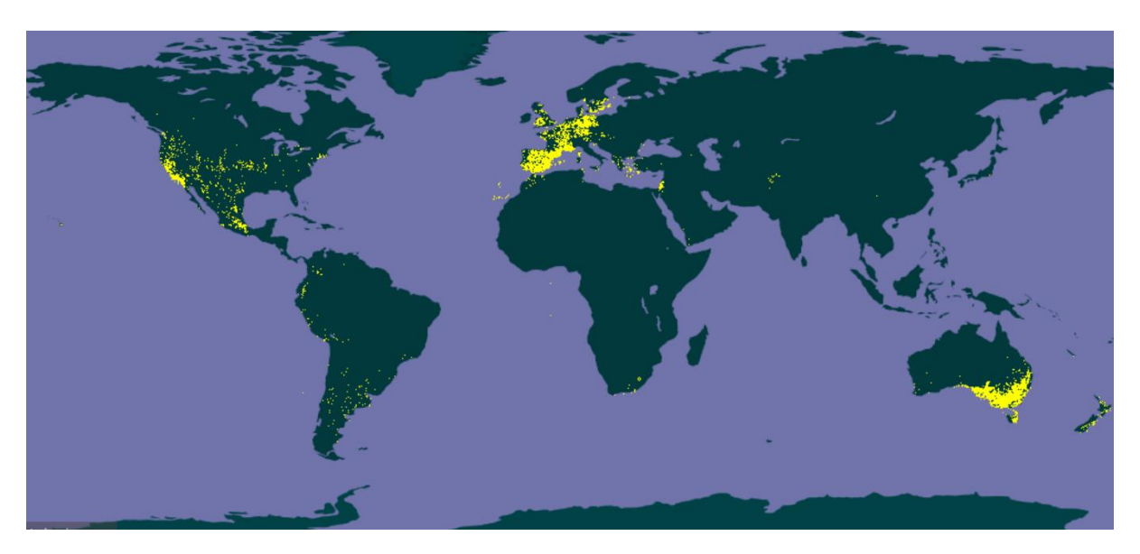
Figure 1: Global distribution of Marrubium vulgare (from GBIF https://www.gbif.org/species/2927069).

Marrubium vulgare L. is native to temperate Eurasia, Europe, the Middle East and the Mediterranean region, including North Africa (Ohtera et al. 2013; Rodriguez Villanueva & Martin Esteban 2016). It is widespread in the Mediterranean areas of Europe and North Africa (Rodriguez Villanueva & Martin Esteban 2016; Fig. 1). It is a weed in southern parts of North America (California, Texas), in South America (Argentina, Chile, Peru, Uruguay), in Australia and in New Zealand (Weiss & Sagliocco 2000, 2012), and was introduced to Brazil during European colonisation (Schlemper et al. 1996). It was introduced to Japan, but not recorded as a weed there. In parts of its native range M. vulgare is cultivated (Egypt: Sabry et al. 2012; Poland: Zawislak 2012; Morocco: Ben Hmamou et al. 2013).