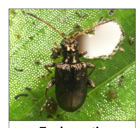
Tradescantia Leaf Beetle

16) Please use the rest of the sheet to record any further observations or comments about the site. Continue over the page if necessary.