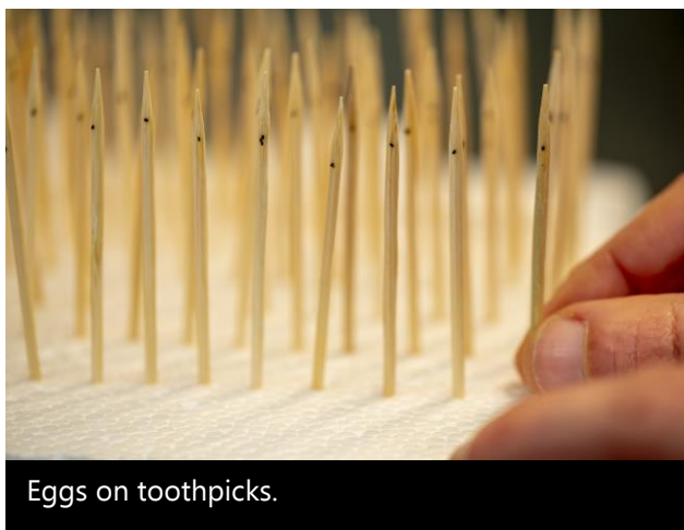
Eggs on toothpicks.

Initial releases were made by gluing eggs onto toothpicks and inserting the toothpicks into cut stems of 2-3 years old horehound plants (one toothpick per plant). Once the moths are well established, it will be possible to dig up and transfer infested plants into new sites in late spring, shortly before adult emergence. At least 200 plants have to be dug up and transferred for each new release site.