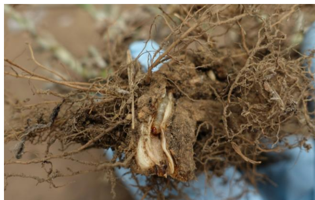
Larva in root tunnel

Larvae feeding internally in the roots and stems disrupt the flow of water and nutrients and weaken the plant, ultimately leading to plant death. Once well established, the clearwing moth may limit horehound spread and density.