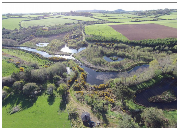
An extensive Integrated Constructed Wetland system, Dunhill, Ireland.

Mitigation wetlands: Bev Clarkson was invited to Ireland in August 2015 by Dr Rory Harrington, VESI Environmental for a 5-day field symposium on Integrated Constructed Wetlands (ICWs) to scope application for NZ environments. ICWs consist of a series of 4–5 shallow free-surface-flow constructed wetland cells containing emergent vegetation. They typically have greater land area requirements than conventional surface-flow constructed wetlands, but their larger footprint facilitates a greater range of physical, biological and chemical processes and richer habitat diversity. These ‘reanimated’ wetlands clean up waterways and provide multiple ecosystem service benefits (biodiversity, recreational, aesthetic, and economic). Dr Harrington pioneered the ICW approach, which has widespread uptake in United Kingdom and Europe. We organised a reciprocal visit to NZ (February 2016) to assess ICW application to Waikato catchments, and Dr Harrington presented an all-day workshop for multi-stakeholders. Workshop presentations are available on our wetland programme website: ICW workshop part 1,2 & 3 . We are currently looking for a Waikato site where we can establish an ICW for research and wider educational (university and general public) purposes.