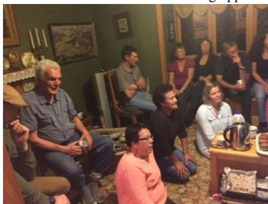
Toreparu Wetland Restoration Group, community meeting, August 2016.

Contribution to national wetland restoration symposium: The biennial National Wetland Restoration Symposium, organised by the National Wetland Trust (NWT), is a key conference for wetland researchers and restoration practitioners. We continue to contribute significantly, with 18 presentations/workshops provided by programme members at the 2016 symposium in Nelson. This included a wetland programme closeout workshop summarising key research findings and outcomes from the 2010–2016 programme, and several other technical presentations by our wetland researchers. Many of the presentations are available as pdfs on the NWT website: http://www.wetlandtrust.org.nz/Site/Wetland_Events/Restoration_Symposia.ashx