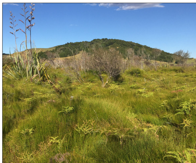
Dense cover of wire rush ( Empodisma robustum ) and tangle fern ( Gleichenia dicarpa ), Otakairangi wetland, Northland (D Campbell).

Otakairangi peatland ecohydrological restoration: Dave Campbell completed a report on the ecohydrology and restoration potential of Otakairangi peat wetland in Northland, a focus of the DOC/Fonterra Living water initiative. Along with surveys carried out by Bev Clarkson and Scott Bartlam, it was discovered that there has been substantial recovery of natural indigenous peatland vegetation, following over 100 years of drainage, fire, and peat degradation.