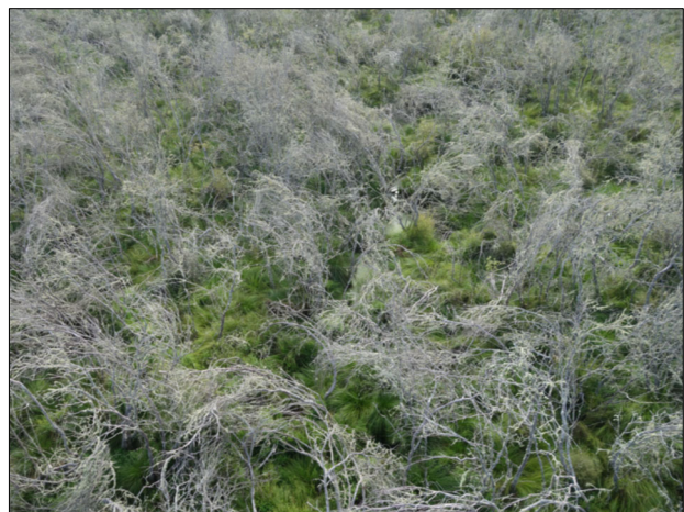
Whangamarino Wetland monitoring after 2012 willow control, L: 2013 (B Clarkson), R: 2015 (K Bodmin).

Algal indicators of wetland condition: We explored the potential for microscopic algae attached to submerged wetland plant stems (epiphytic diatoms) to provide information on wetland condition using data from 77 lowland sites (mainly palustrine swamps) with circumneutral pH (Kilroy et al. 2017). In the South Island, correspondence between diatoms and wetland indices or water quality was weak. In the North Island, conductivity and total dissolved nitrogen (TDN) together explained around half the variance in assemblage composition, and several diatom genera were indicative of high or low conductivity and dissolved nutrient concentrations. Our results showed that diatoms (siliceous algae) respond rapidly to water quality changes,