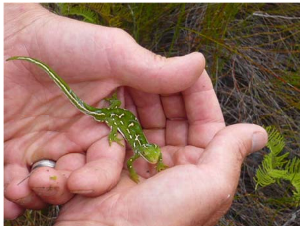
Auckland green gecko Naultinus elegans identified by Rod Hitchmough, DOC.

MSc student Catherine Sturgeon has been busy sampling water at Kopuatai and measuring dissolved organic carbon (DOC) concentrations under different vegetation types. Her goal is to determine the flux of DOC out of the bog, which will contribute to a complete ecosystem carbon budget (CO 2 + CH 4 + DOC) and its sensitivity to environmental and climate change. New MSc student Alex Keyte-Beattie will start her research later this year on “What is the functional role of the Empodisma robustum canopy in ecosystem exchanges of carbon and water?” A distinctive feature of northern NZ bogs and fens is the dense tangle of dead E. robustum stem material (around 24 tonnes/ha!) that shades the moist peat beneath. Understanding its functional properties will be a key to restoring these special wetlands. Dave comments that a bonus of visiting Kopuatai regularly has been seeing some interesting animals, including the first reported sighting of a gecko – an Auckland green gecko Naultinus elegans . Other fauna encountered include fern birds, NZ praying mantis, orb spiders, a locust, and jet black cockroaches inhabiting the battery box. Dave and team have placed six DOC 200 traps along their trail, and so far have killed eight stoats.