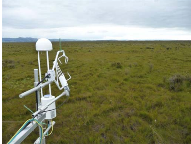
Eddy covariance sensors tower over the Empodisma bog canopy.