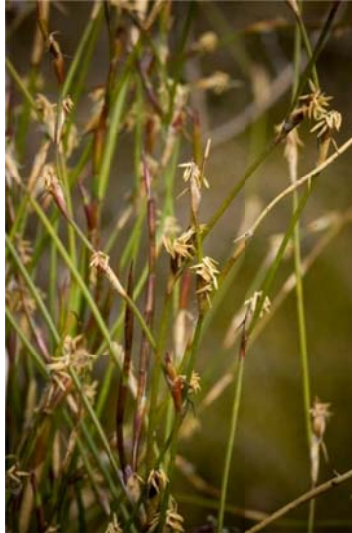
Empodisma robustum (wire rush) showing male flowers with stamens

http://www.eurekaalert.org/pub_releases/2012-07/pp-ans070912.php