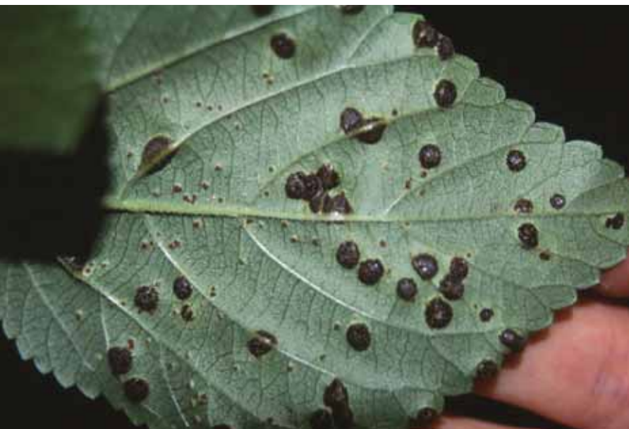
Lantana camara (Brisbane common pink) infected with both Puccinia lantanae (larger pustules) and Prospodium tuberculatum .