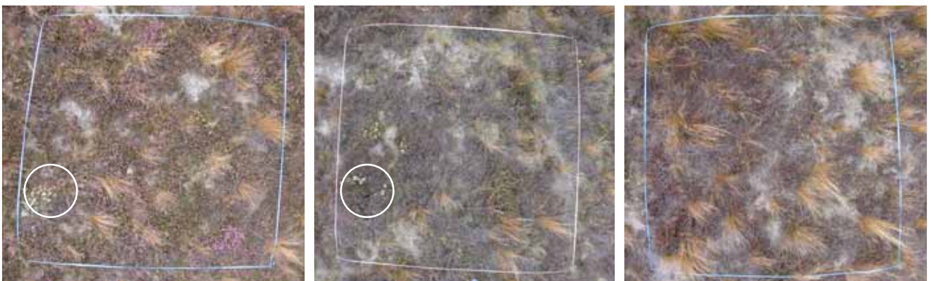
Right to left: Uncontrolled plot, plot attacked by heather beetle and plot with herbicide treatment. Note the white flowers of the native Ozothamnus leptophyllus disappear after herbicide control.

Feeding behaviour may also be a contributing factor towards poor heather beetle performance, particularly for populations that crash after establishing. Heather beetles appear to do