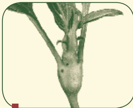
Mist flower gall fly gall

branches over a piece of white card or material, and if numbers are good you could shift infested material to new sites. It would also be useful to check how far they have dispersed.