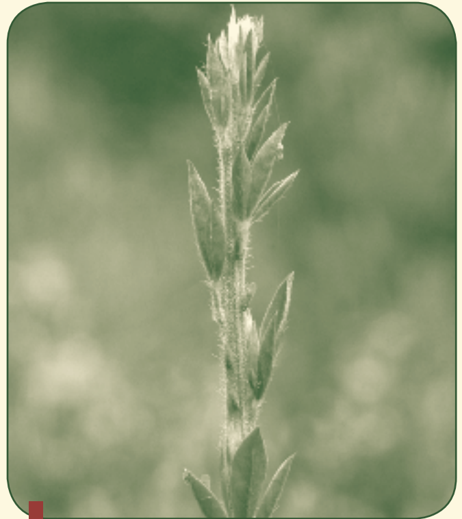
Broom psyllid adults

nearing pupation. Pupae often fall out of the webs onto the ground so, once they have developed through to that stage, they will not be easy to identify unless the damage to new growth is so severe that it can't possibly be anything else.