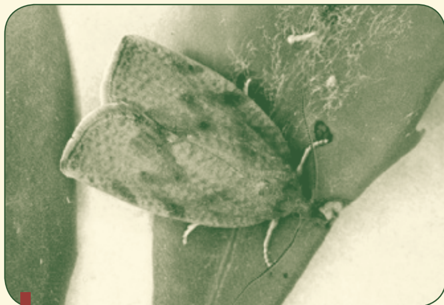
Boneseed leafroller adult

This project is funded by a national collective of regional councils and the Department of Conservation.