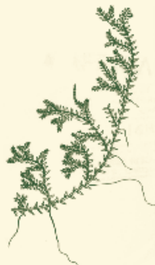
Flora of South Africa