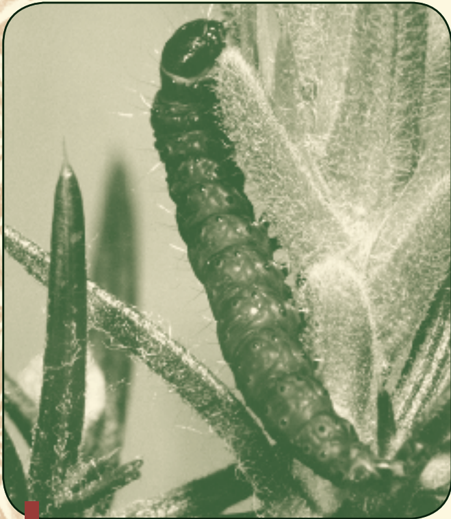
Gorse soft shoot moth caterpillar