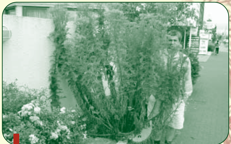
Quentin Paynter tries unsuccessfully to hide behind a large Australian fireweed plant ( Senecio bipinnatisectus ) that had taken up residence in a Rotorua front garden.

The plant ecologists found that in addition to naturalisation being concentrated within certain genera, weediness was also. Using their Australian data they found that genera within the same family behaved differently in terms of weediness. They compared species of the genera Centaurea and Helichrysum , both from the Asteraceae family. They found that of the 36 species of Centaurea that had been introduced into Australia, 15 had naturalised and 4 were