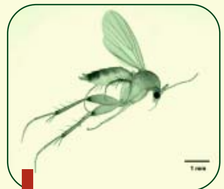
A native fungal gnat ( Mycetophila dilatata ) was very abundant at the second kānuka site.

Insect assemblages in a native (kānuka ñ Kunzea ericoides ) and an invasive (gorse ñ Ulex europaeus ) shrubland. New Zealand Journal of Ecology 28(1): 35–47.