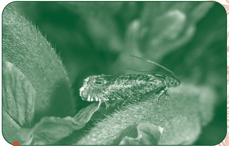
Gorse pod moth