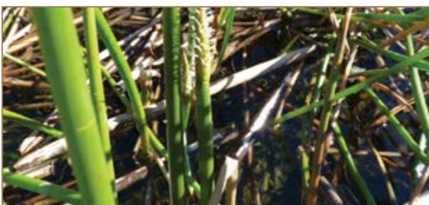
New fertile stems emerging in Spring.