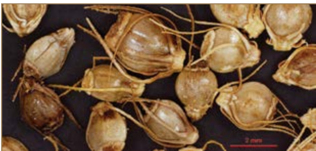
Kuta seeds.

Transferring seedlings or rhizome material outside the rohe where kuta is traditionally harvested to create a new site is not common – weavers would prefer to nurture their own pā kuta. One weaver interviewed gathered seed at the time of harvest and distributed it in the same general area to help regeneration of the pā kuta.