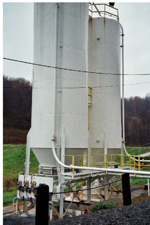
Figure 1: Active treatment system.

Treatment can be accomplished by either active or passive treatment systems (Figures 1 and 2).