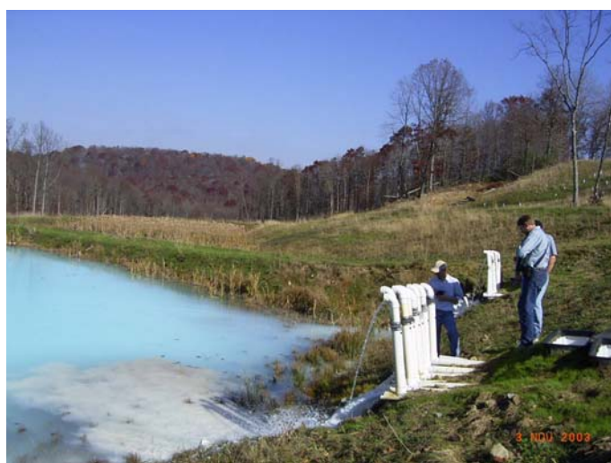
Figure 2: Passive treatment system.

Active systems are more suited to active mine sites, which typically have limited land area available for remediation systems, changing drainage chemistry and flow rate, power and personnel to manage the system.