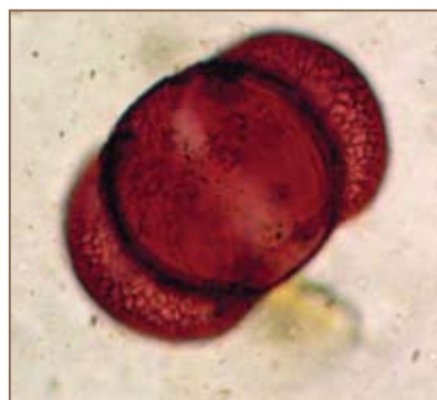
Pine pollen. Both the pine (introduced) and kahikatea (native) pollen samples are stained with carbol fuchsin dye.

Data interpretation requires statistical analyses and an understanding of radiochemistry.