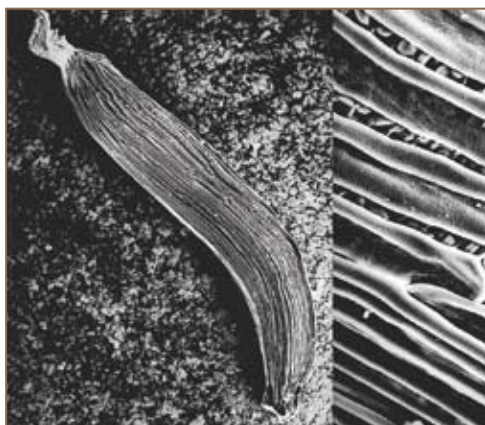
Manuka seed enlarged x30 and x300.

ACKNOWLEDGMENTS: The following organisations kindly contributed information and current (2010) costings to this chapter: The Cawthron Institute, Hill Labs, the Waikato Radiocarbon Dating Laboratory, the National Radiation Laboratory, the Rafter Radiocarbon Dating Laboratory, the Geography Department University of Otago and the Zoology Department University of Otago.