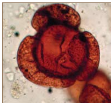
Kahikatea pollen. Studying fossilized pollen can reveal historical vegetation patterns, and imply changes in land use, climate, and disturbance regimes.

Interpretation is relatively straightforward but can be complicated by bioturbation, translocation of ^{137}\text{Cs} rich soil from upstream erosional areas.