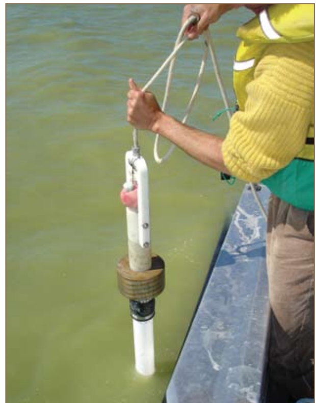
Where water depth is greater than c. 1.5 m, long lengths of plastic pipe can be pushed or driven into the sediment from a boat. Gravity coring in Lake Ellesmere, Canterbury.

After sub-samples of the core have been taken for palaeo-ecological analyses, the core should be archived by wrapping it in plastic and storing it in a cool location, in case further analyses are required. If the core is cut lengthwise, sub-sampling should be conducted on one half of the core while the other half should be archived intact.