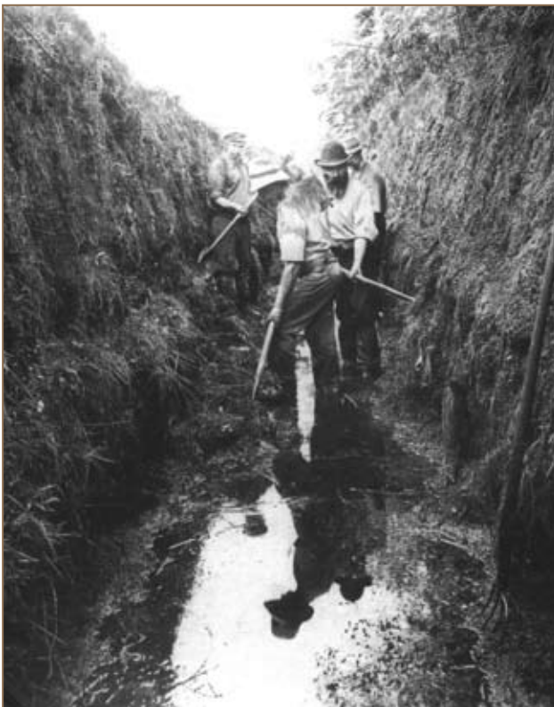
Extensive networks of drains were hand dug in the Waikato, turning swampland into productive pastures.