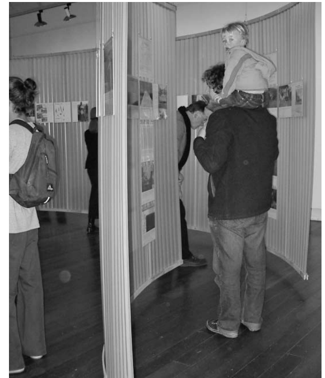
Visitors to the Travelling River Exhibition

Another small question that emerged from the work was that of depth versus breadth. The exhibition was very broad, which most of the group felt was true to the original theme of Mountains to the Sea . However, some interesting lines of enquiry might have been followed if there had been an opportunity to drill down more deeply. Another benefit of the 'broad' approach was the involvement of many more people – a stated aim of the project proposal.