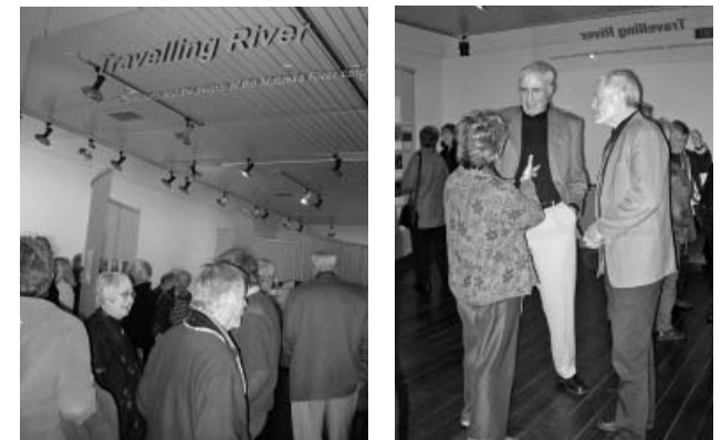
Travelling River exhibition opening, Suter Gallery, Nelson, August 2004.

This report reviews the process by which a group of artists and scientists came together in the Mountains to the Sea project to generate a unique cross-disciplinary collaboration. Groups working together on projects where the task or product is not defined 'up front' inevitably produce something distinct from what any one individual may have developed alone. But such working relationships, particularly when engaging people from diverse disciplines and world views, are not always easy and can require close attention to the processes of developing a working language, and ultimately a shared vision. How this was achieved is the focus of what follows.