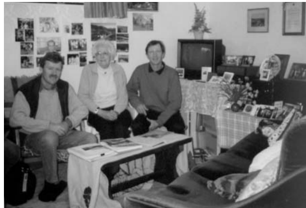
Collecting images and having conversations with residents of the Motueka Catchment

the catchment that were not represented in the exhibition or in the information gathering and linkage building. Our focus on photos eliminated people who don't take photos. Many of the people in this category would be marginalised, poorer groups. Also, the local Māori community had few of their own photographs of their involvement in current environmental projects. However, our interest in including them meant one artist went out to take photos and collect stories to go into the exhibition.