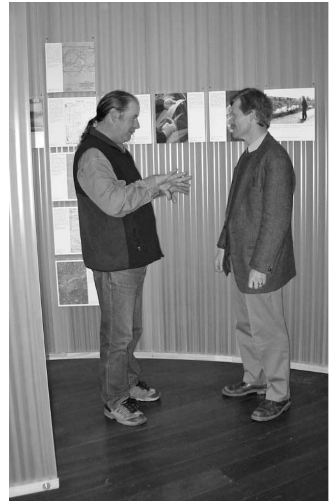
Conversations at the Travelling River Exhibition

science and art in the project, a point they returned to frequently. In addition, interactions between individuals were also important and at times might have been improved with more conscious acknowledgement of the importance of those phone calls and conversations.