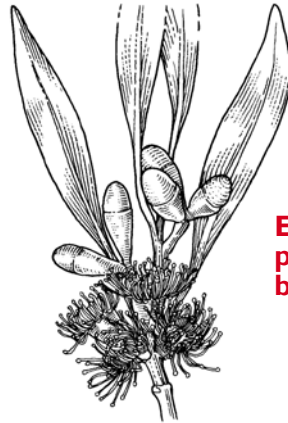
Eucalypt flowers provide nectar for bellbirds