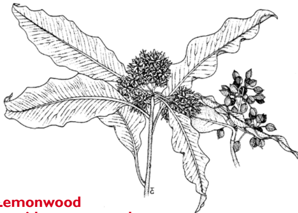
Lemonwood provides nectar and fruit for bellbirds

Plant a variety of plants so there is continuation of food supply throughout the year. Existing tall trees, both native and exotic, can also provide essential roosting and nesting sites. By improving the habitat in your garden and neighbourhood you can enhance bellbird survival.