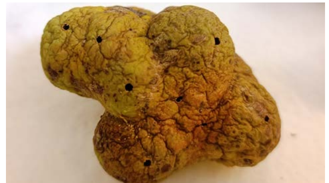
Numerous emergence holes on an imported gall