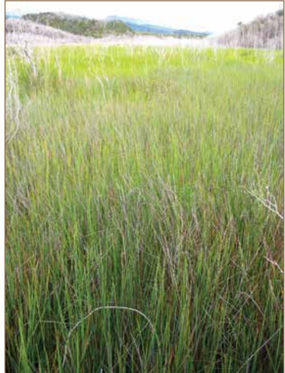
Mangarakau swamp sedge community