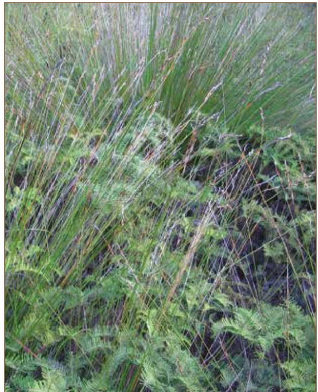
Low nutrient pakihi community, Milnthorpe Park Scenic Reserve, Nelson.