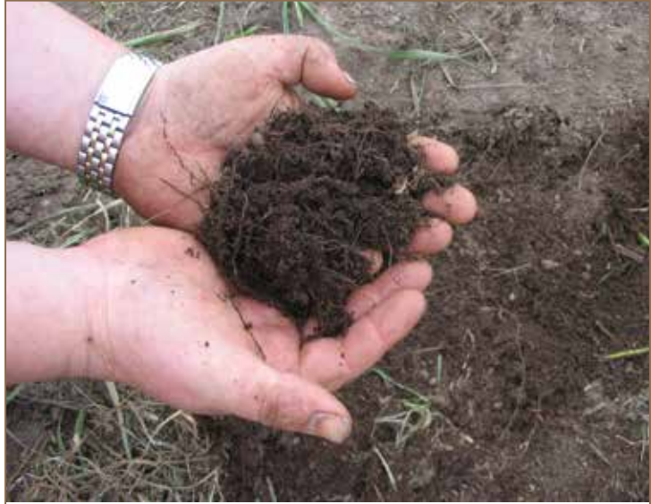
Nutrient rich sediment harvested from a silt trap can be reused away from the restoration site. Lake Kaituna, Waikato.