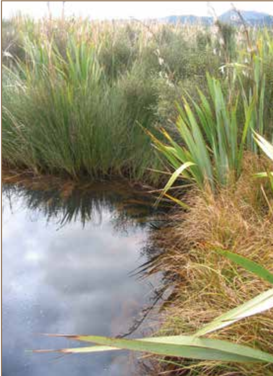
Mangarakau swamp flax community