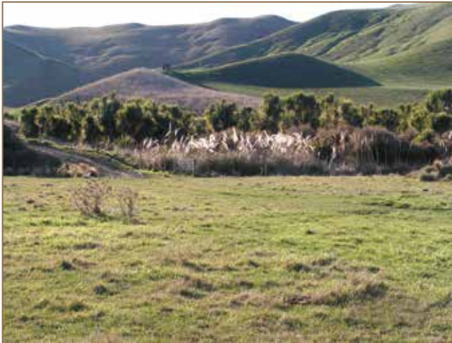
Wetland restoration success: this wetland on a farm in Marlborough highlights what can be done when appropriate native species are used and nutrient inputs to the wetland well managed.