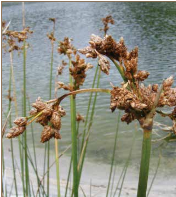
Lake clubrush ( Schoenoplectus tabernaemontani ) is commonly planted in NZ constructed wetlands.