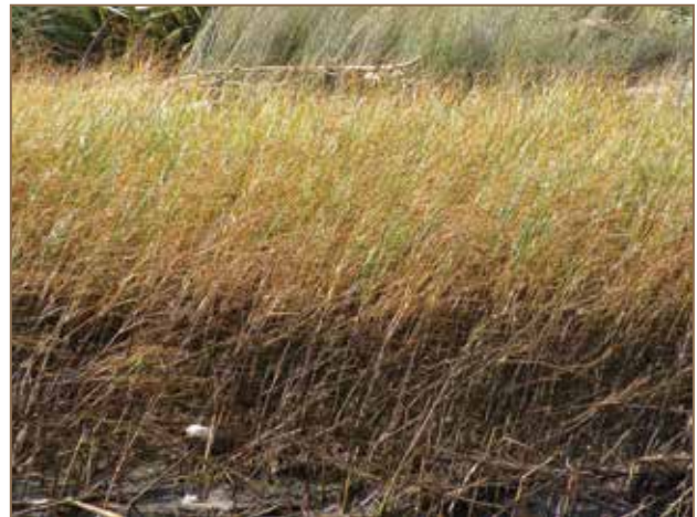
Marsh clubrushes ( Bolboschoenus medianus — pictured, and B. fluviatilis ) are useful species for providing seasonal diversity in treatment wetlands.