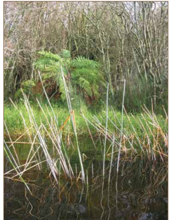
An example of a low nutrient environment: the naturally peat stained waters of Lake Serpentine east, Waikato.

The Howarth Memorial Reserve lies at the edge of the extensively farmed Hauraki Plains creating challenges for effectively managing nutrients entering the wetland from both the river and farm drainage networks