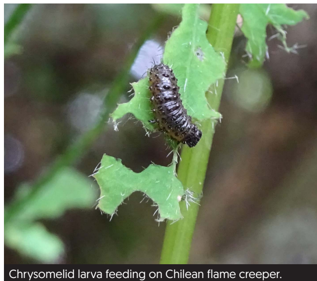
Chrysomelid larva feeding on Chilean flame creeper.

Fortunately their efforts were not in vain, and they managed to find another two sites to add to the list. Of the four sites that were surveyed, three were along roadsides and one was in a hazelnut orchard. At all three roadside sites black insect larvae were found actively feeding on the leaves of Chilean