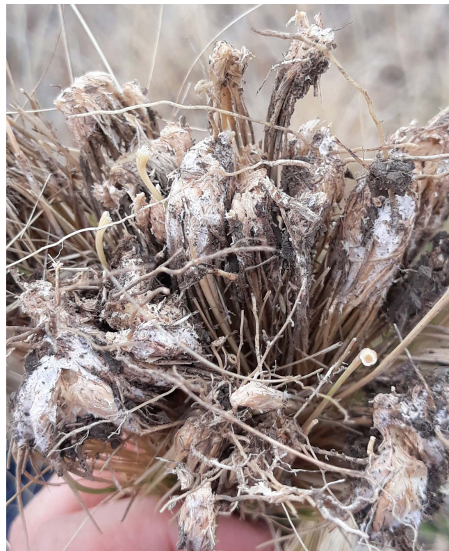
Nassella tussock with characteristic white mycelium.