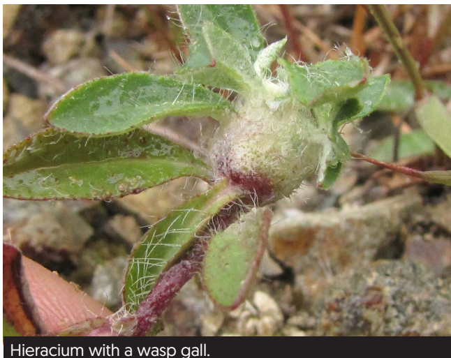
Hieracium with a wasp gall.