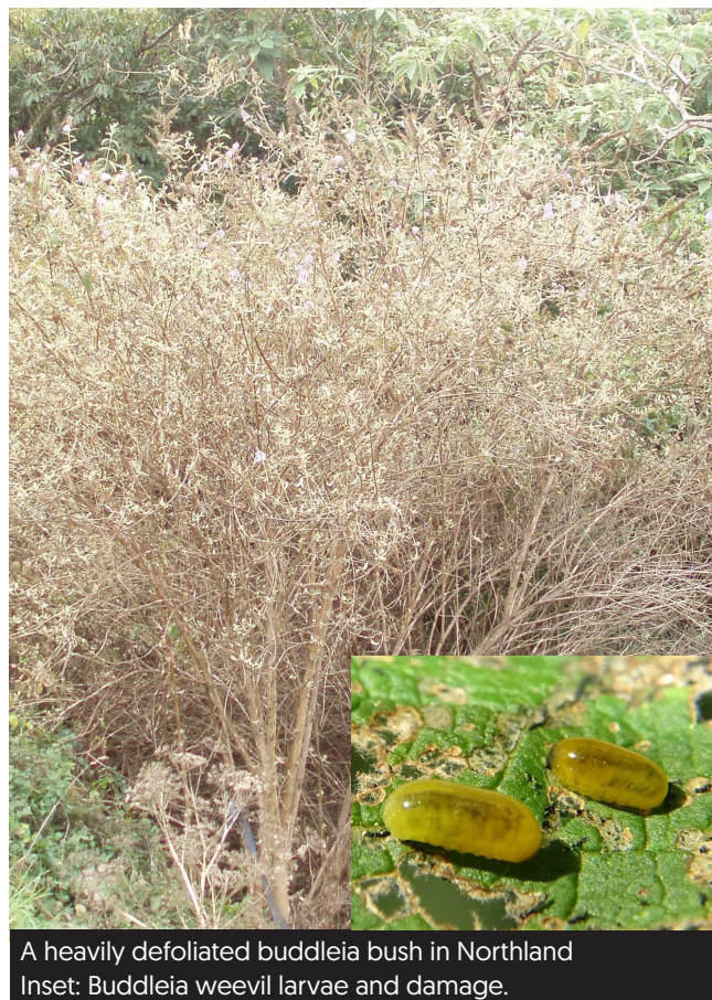
A heavily defoliated buddleia bush in Northland Inset: Buddleia weevil larvae and damage.