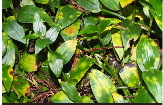
Yellow leaf spot fungus on tradescantia.