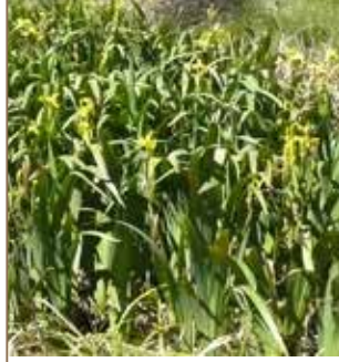
Yellow flag iris.