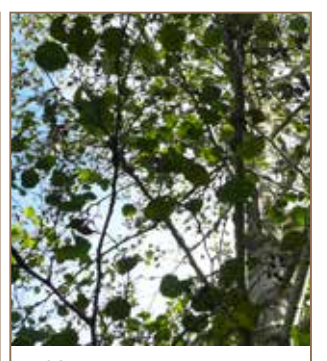
Alder canopy.