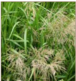
Reed sweetgrass.