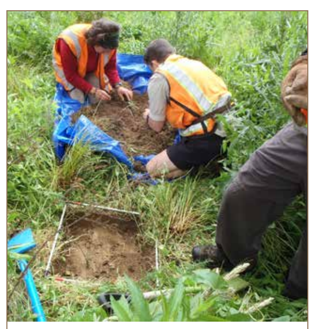
Carefully searching soil during sampling for Maurea Island noke.

Along with the invading exotic plants like grey willow, crack willow, alder, and numerous pasture weeds, introduced European and Asian earthworm species appear to be invading some of our lowland wetlands. Recently, populations of European earthworms have been discovered in wetlands in Hawke's Bay, Bay of Plenty, and Waikato. In 2014 introduced earthworms were discovered while monitoring an island restoration project in the Waikato River (see inset box).