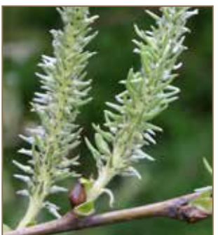
Grey willow.