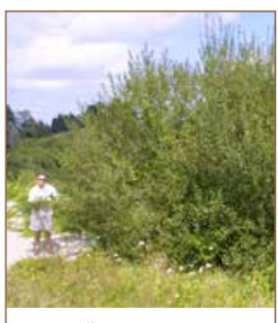
Grey willow.

Overseas research has shown that when earthworms are introduced into constructed wetlands they can modify or engineer significant changes to those wetlands. Further observations, monitoring, and research are needed to understand whether in Aotearoa these exotic earthworm species are changing the nature of our wetland soils and what can be done about such change.