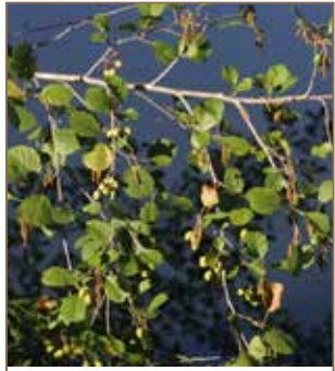
Alder.