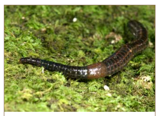
Noke (Megascolides maoricus).

We also know that Aotearoa has more than 20 introduced exotic earthworm species from Europe and Asia that are mostly found in our pasture and weedy areas. From what has occurred in other countries we can learn that exotic earthworms can invade and alter intact native ecosystems but that the ecosystems most at risk of large-scale changes are those that have not evolved with earthworms.