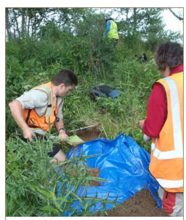
Excavating a 50 cm x 50 cm pit during sampling of Maurea Island noke.