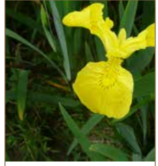
Yellow flag iris.