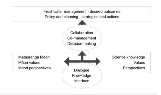
Figure 3 . Dialogue space for understanding mātauranga Māori and science knowledge used to inform decision-making.

Mātauranga Māori to inform collaborative process – Mātauranga Māori includes Māori beliefs, perspectives, and knowledge (e.g. traditional, holistic, local and contemporary) and can be used to articulate modern local interests, values and resources (e.g. customary resources, mahinga kai). Tribal and generic knowledge systems are used to determine the values to be managed and protected, and these can then be used in collaborative processes (Fig. 3) to identify attributes and limits, as well as mechanisms for co-management and co-planning.