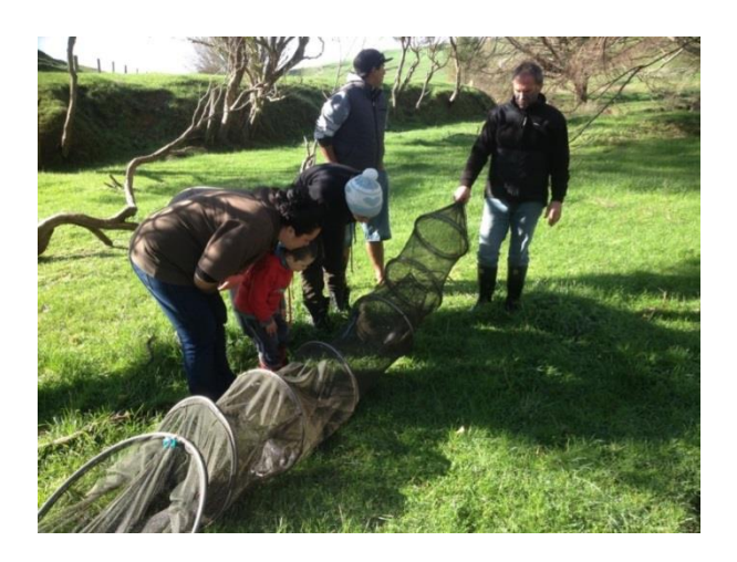
Figure 4. Freshwater CHI monitoring with Te Uri o Hau kaitiaki at Hanerau Farm, Ōtamatea, northern Kaipara.

Ngā Waihotanga Iho: Iwi Estuarine Monitoring Toolkit (Rickard & Swales 2009a,b)