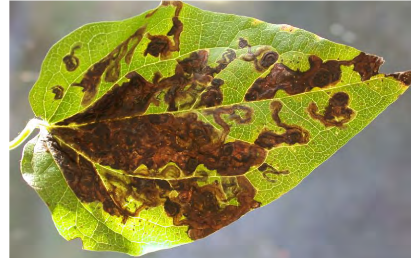
Leaf mining fly impact