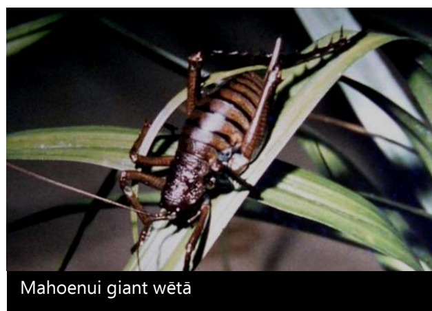
Mahoenui giant wētā

There are some cases where threatened species have come to depend on weeds. For example, the Mahoenui giant weta ( Deinacrida mahoenui ) was found to be using goat-grazed gorse ( Ulex europaeus ) near Te Kuiti to escape predation by rats. However, in cases like this, management techniques such as predator control, supplementary feeding, and providing nest boxes can be used to ensure the survival of threatened species.