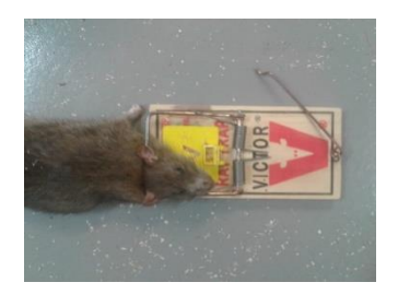
321.1 g female