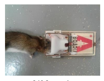
240.3 g male