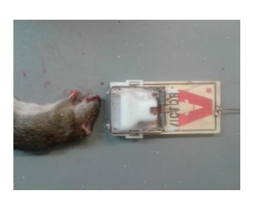
305.8 g male