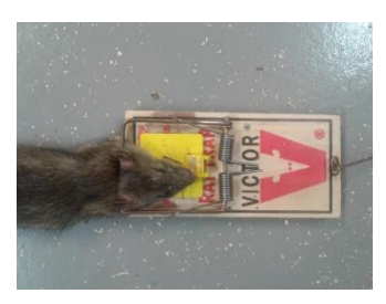
182.3 g male