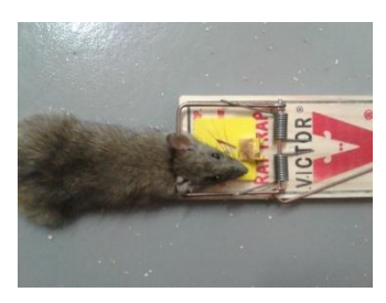
162.9. g female