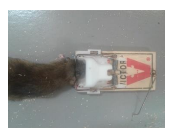
228.7 g male