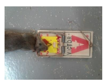
191.9 g male