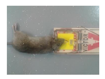
105.5 g female