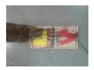
243.5 g male