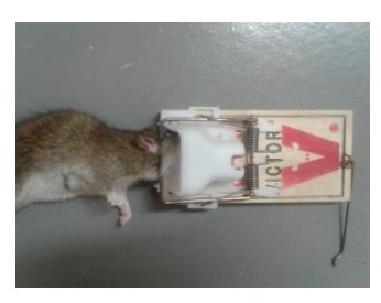
271.8. g male