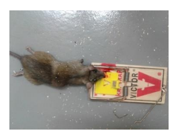
169.5 g male