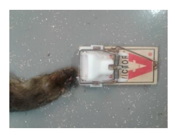
295.8 g male