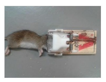
150.9 g female