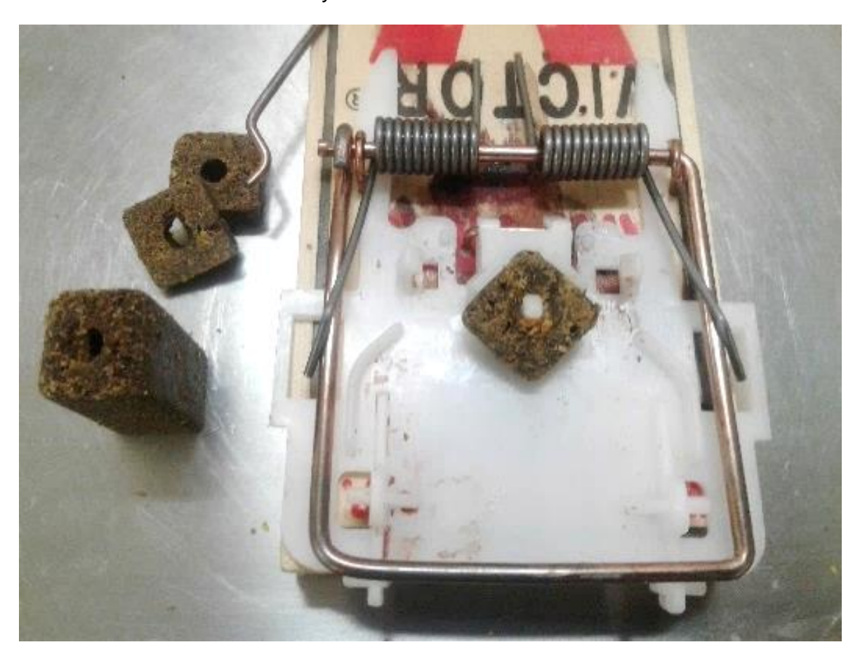
Figure 4. Baited unset Modified Victor stoat and rat trap showing method of baiting (shroud removed) with Mustelid and Cat lure block and slices.

The traps were set inside Predator Free NZ wooden tunnels as in tests 1 and 2. The trap was baited with a slice of Mustelid and Cat lure<sup>3</sup> smeared with either a small quantity of bacon fat or smooth peanut butter on the upper surface of the lure (Figure 4). Testing was carried out from 13 to 28 February 2019.