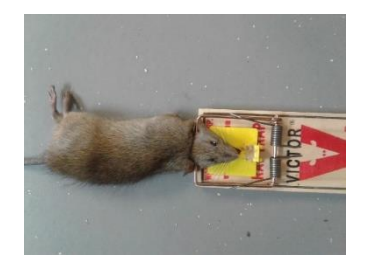
220.3 g male