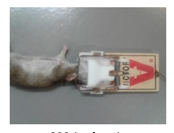
206.4 g female