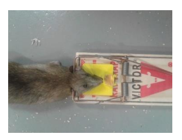
163.1 g male