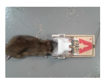
217.6 g male