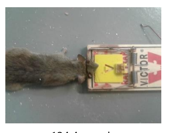
124.4 g male