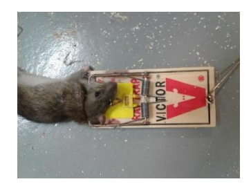
276.4 g female (fail)