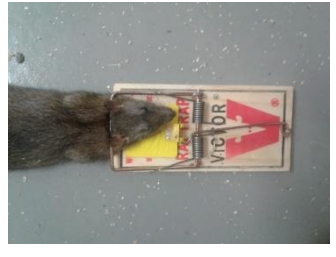
238.8. g male