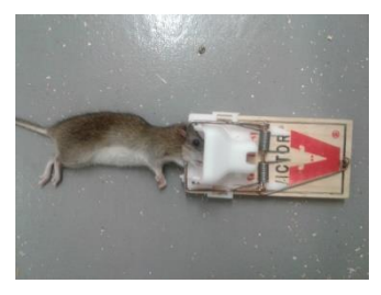
129.2 g female