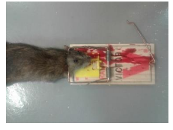
338.1 g male