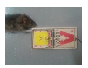
277.3 g male (fail)