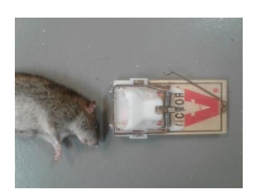
415.1 g male