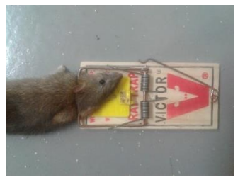
179.8 g female