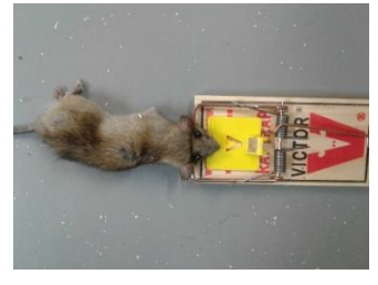
102.1 g female