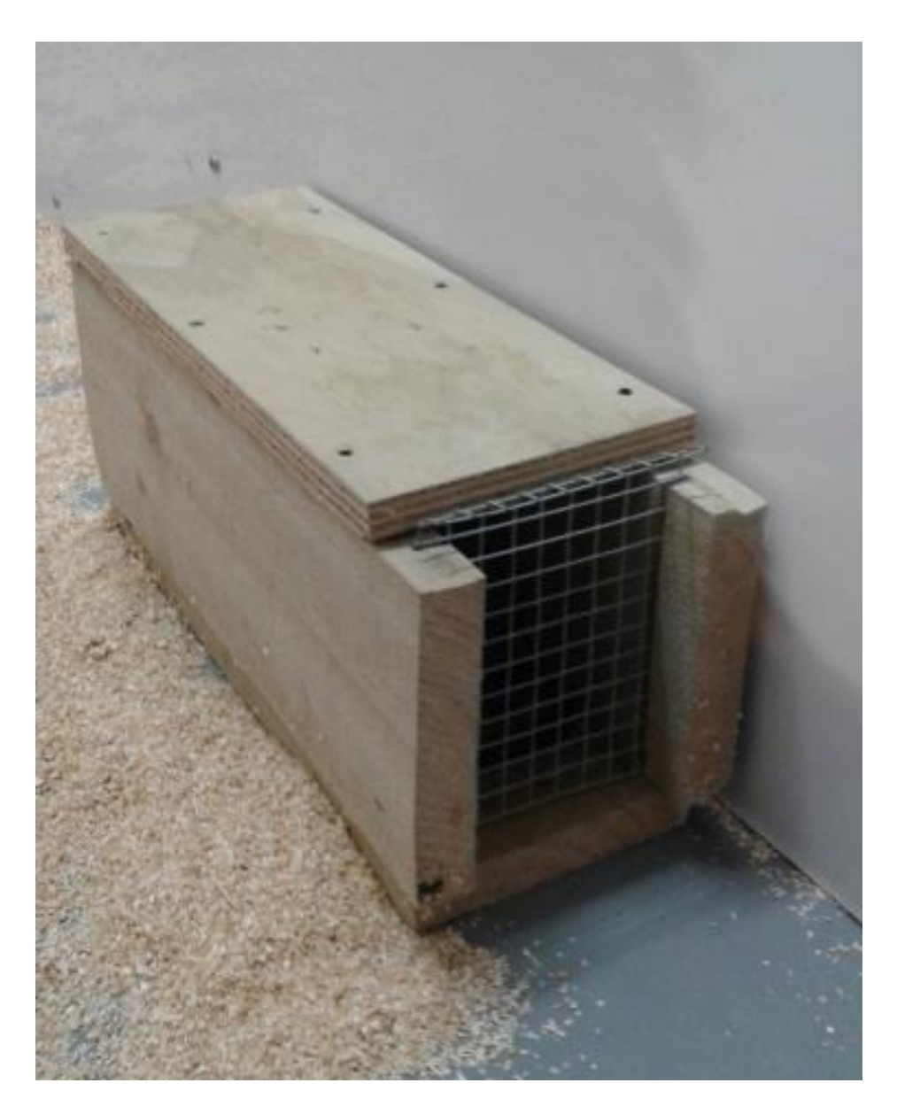
Figure 2. The Predator Free NZ wooden trap tunnel. A 50 \times 50 mm entrance hole was cut in the mesh at the far end of the tunnel (not visible) and the mesh at the closed end of the tunnel was removable to allow access to the trap. The Victor® Professional rat trap or Modified Victor stoat and rat trap was set 1–2 cm into the tunnel from the closed end. Two tacks were nailed into the trap tunnel floor in front of the trap to prevent it being pulled forward by a rat or pushed too close to the entrance hole in the front mesh when deployed.

When a rat was struck by the trap, the time to loss of palpebral (blinking) reflex was measured to determine whether the trap had rendered the captured animal irreversibly unconscious within 3 minutes. For the trap to pass the NAWAC trap-testing criterion (2011) as a Class B trap, 10 of 10 rats needed to be rendered irreversibly unconscious within 3 minutes. Once irreversible unconsciousness was identified, a stethoscope was used to determine cessation of heartbeat.