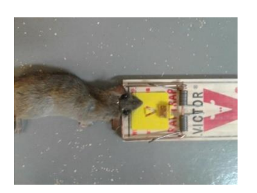
145.7 g male