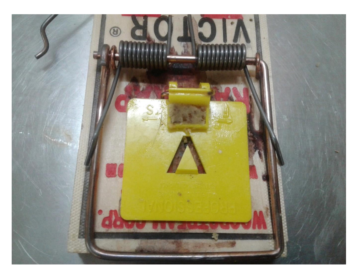
Figure 3. Baited unset Victor® Professional rat trap showing placement of bait in the purpose-made bait-well.

The traps were set in Predator Free NZ wooden tunnels and baited with either walnut paste, Nutella® or smooth peanut butter, applied in the purpose-made bait well near the pivot on the yellow treadle (Figure 3). Once set, the trap was placed in the tunnel so that the back edge of the trap was about 1–2 cm in from the rear mesh, so that there was enough room in front of the trap to allow a rat to fully enter the tunnel. Two tacks were nailed into the trap tunnel floor in front of the trap to prevent it being pulled forward by a rat or pushed too close to the entrance hole in the front mesh when the trap was placed in the tunnel. Testing started on 27 November 2018 and was completed on 9 December 2018.