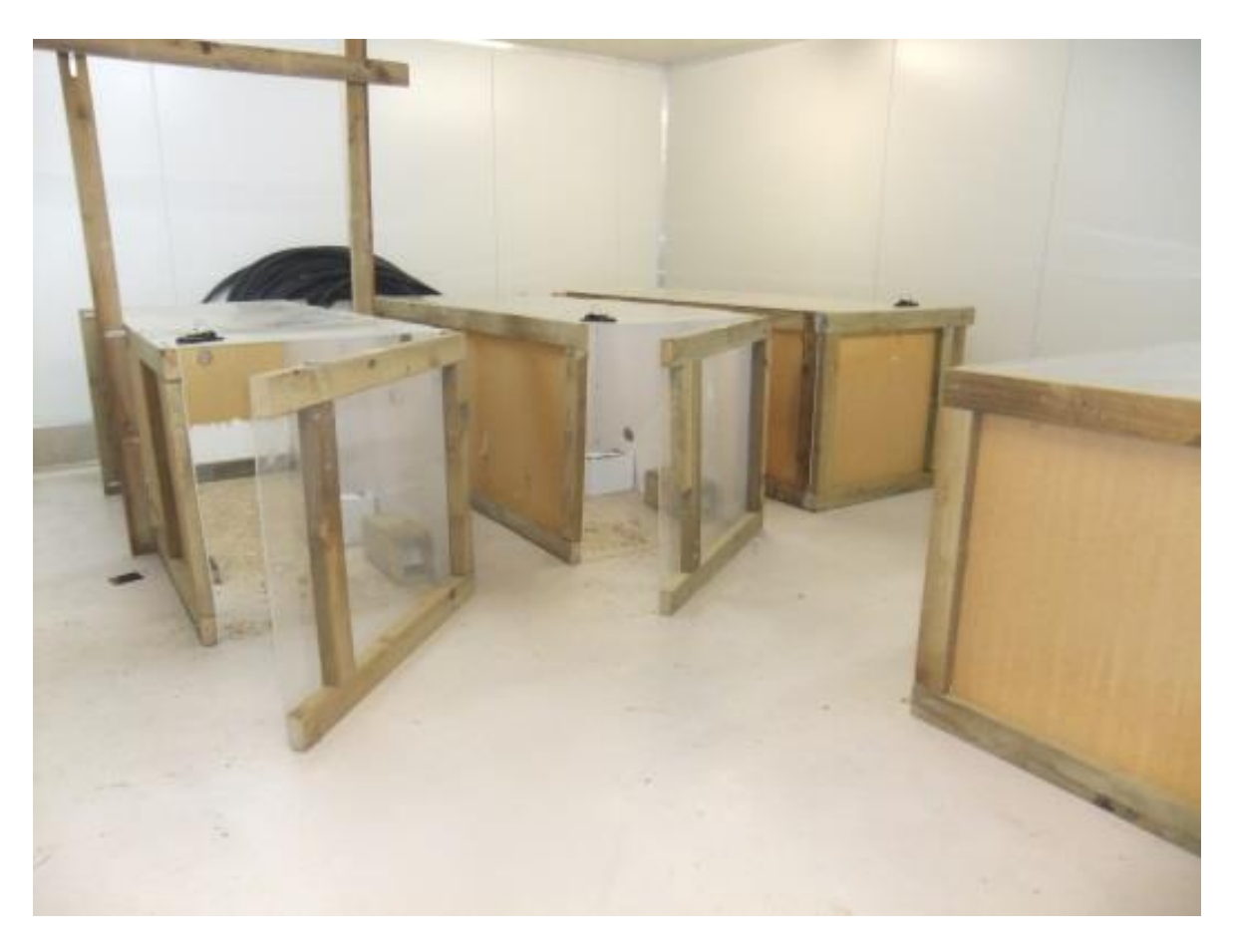
Figure 1. The four arenas used for trap testing. Rats were provided with a nest box, had free access to water, and were fed with standard rodent pellets (ProLab RHM 1800 LabDiet, PMI Nutrition International, MO, USA). Two arenas are shown with Predator Free NZ wooden trap tunnels in place.

Wild-caught rats were acclimatised to captivity in cages before being transferred to test arenas for the trap testing (Figure 1). Rats were confined individually in each arena and tested in a free-approach test during late afternoon or evening. In each arena, a trap was set in a Predator Free NZ wooden tunnel (Figure 2).