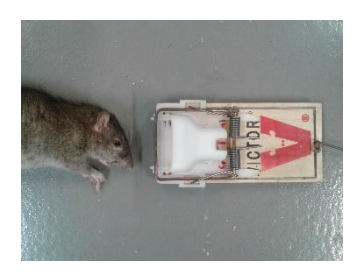
347.9 g male