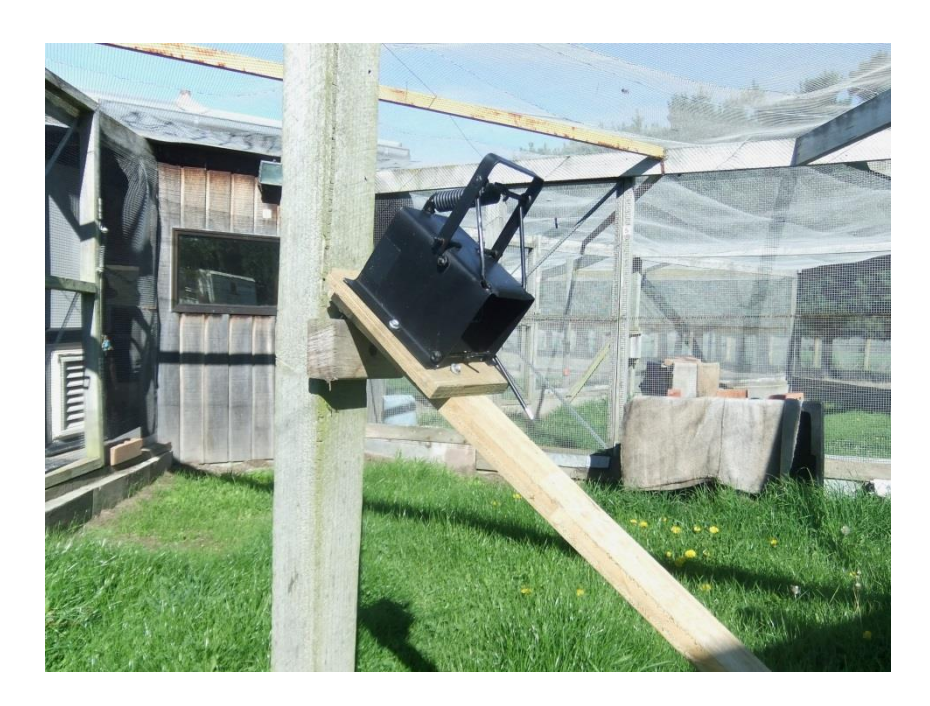
Figure 1 SA2 Kat kill trap set at the top of a leaning board. Trap shown unset.

Cats were acclimatised to captivity in outdoor pens for at least 2 weeks before being transferred to observation pens for the trap testing. Cats were penned individually and the trap was tested in a free-approach test. In each observation pen a trap was set at the top of a leaning board c. 1 m above the ground (Fig. 1). The trap was baited with chicken mince on the floor of the trap, and two small smears of mince were placed on the leaning board to encourage cats to walk up the board towards the trap. Once set, the base of the trap trigger was 90 mm in from the mouth of the trap.